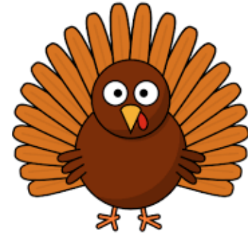
Turkey 1 st three-peat 4-0