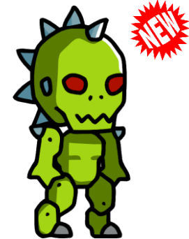
Chupacabra JIB-19 19 th 4-0