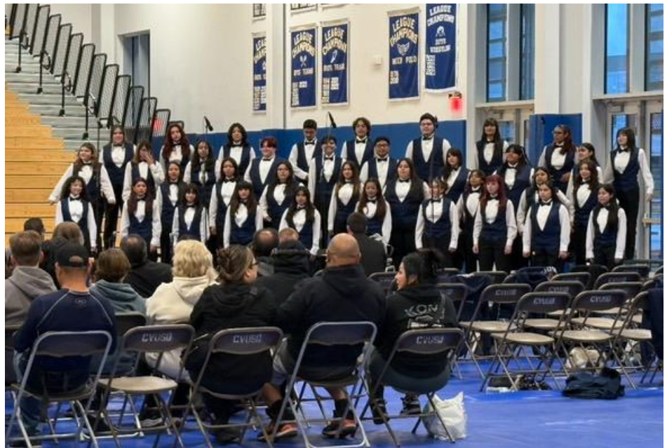
Moments from the Annual Choir Showcase.