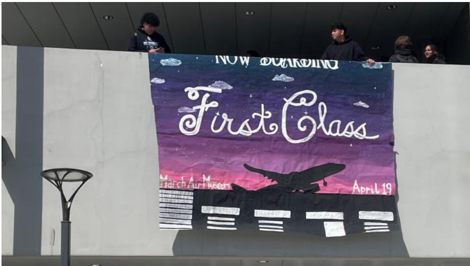
Prom theme revealed during prom expo with poster made by ASB juniors.

On March 7 th , the prom theme was revealed during the prom expo at lunch in the quad. This year’s theme is “Now Boarding: First Class.”