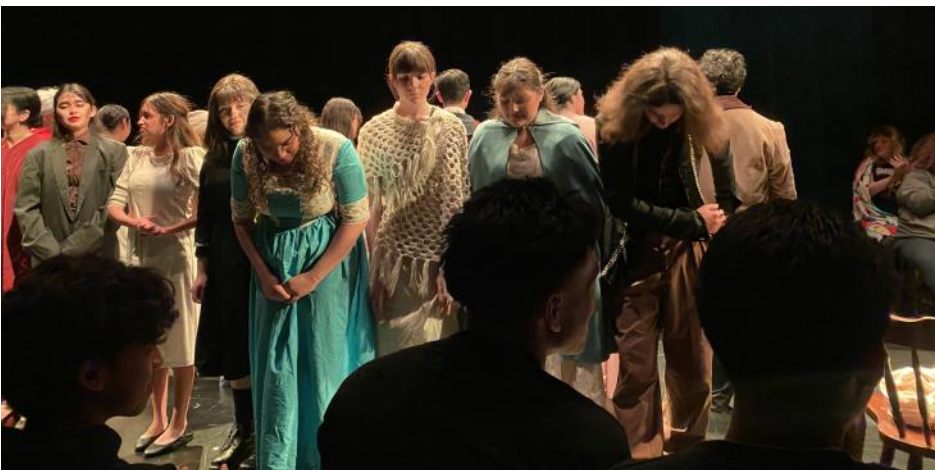
Theatre production crew thanking their audience by bowing. After completing their heart touching performance.