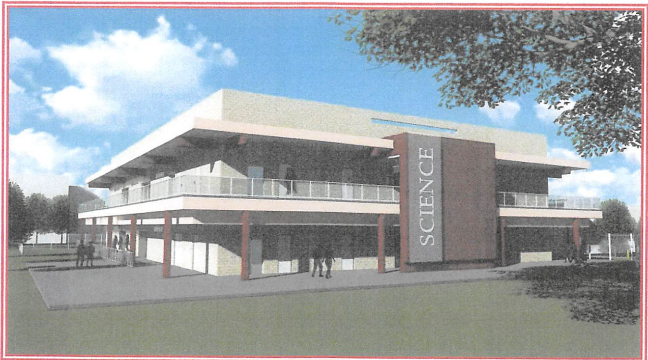
Architect's rendering of the new Ayala HS Science Building

Phase 0, the relocation of 12 portable classrooms was completed over the summer and the rooms are now in use. The construction documents for the new science building have been submitted and are pending DSA approval. The construction documents for the modernization project are in progress.