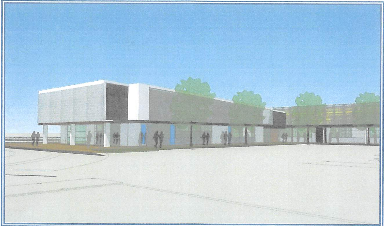
Architect's rendering of the new Briggs K-8 Science Building

Construction documents for Magnolia JHS and Ramona JHS have been submitted to DSA. Phase 0, renovation of the Briggs parking lot has been completed. Construction documents for the Briggs interim housing and new science building projects are in progress and will be submitted to DSA in early 2019. Construction documents for Canyon Hills JHS and Townsend JHS are in progress.