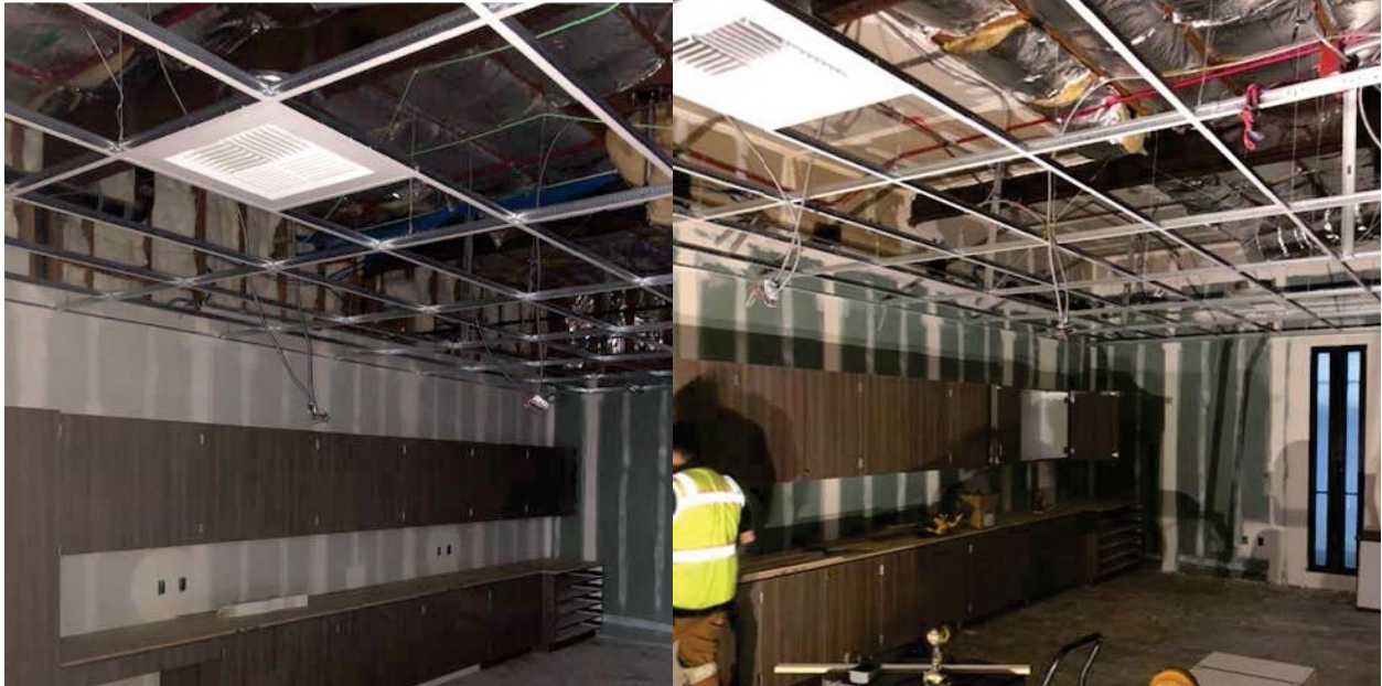
B Building, Girls and Boys Locker Rooms