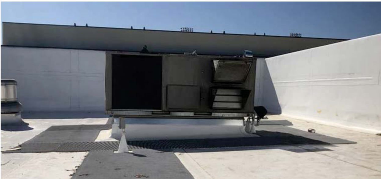
Ayala HS F Quad Roofing

The B quad is 100% complete, with work in the F quad well underway. Concrete pads have been poured, new roofing is complete, and classroom interiors are being set in place. The F quad is on track to be completed December 2020, with work in H quad scheduled to begin immediately after. Plans for the next phases of modernization have been reviewed by the District and have been submitted to DSA for approval. This work will include the admin building, MPR, library, gym, D quad, pool deck facilities, and mechanical equipment rooms.