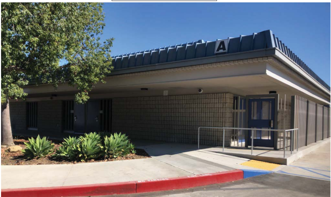
Rolling Ridge ES Bldg. A

Both sites are now 100% complete. All safety and security measures have been activated and all site furniture has been delivered with staff awaiting the return of students.