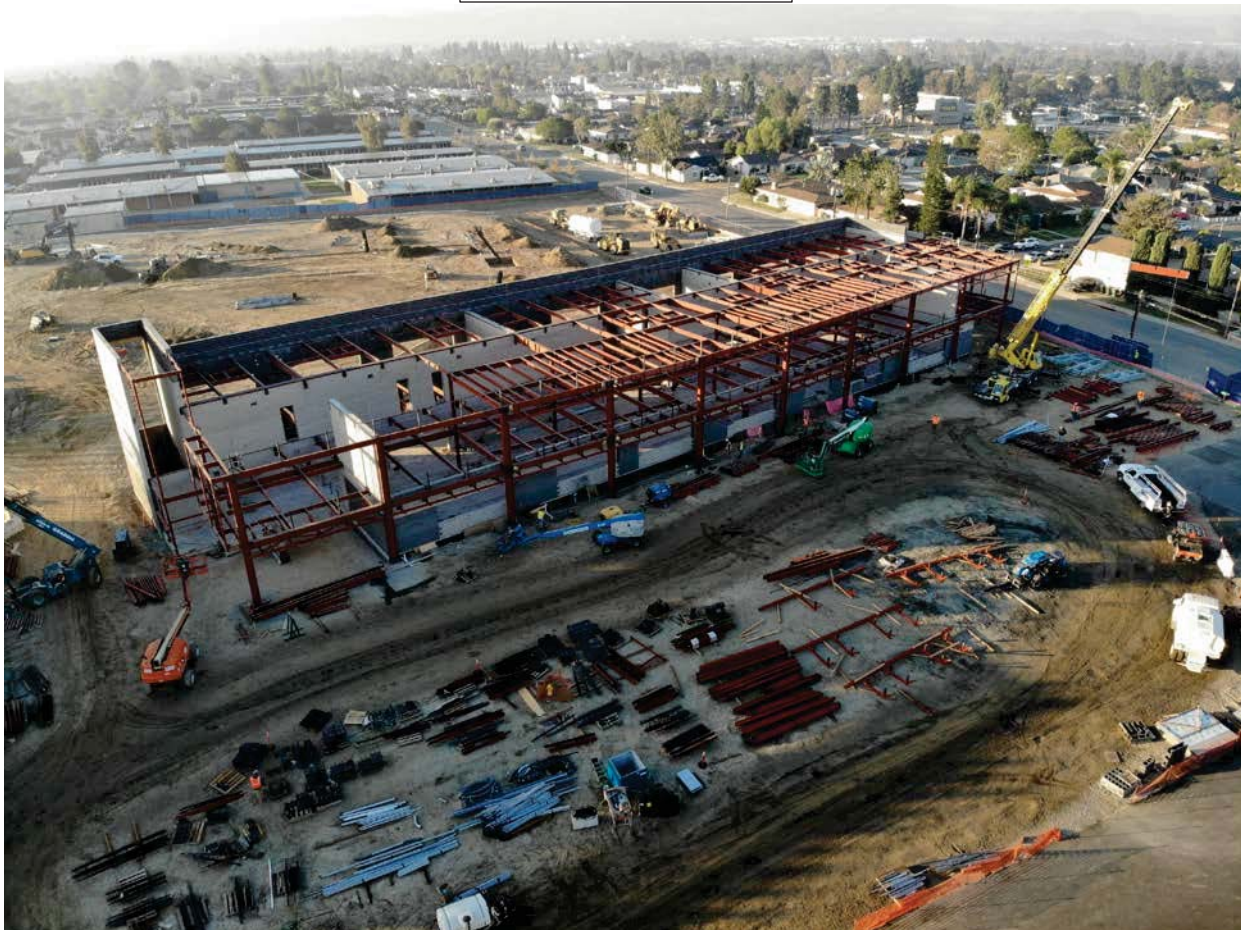
Chino HS Bldg. A

Construction of Phase 1 buildings is underway and on track with an estimated completion date of March 2022. Buildings A, B, C, D and E are all at or near their top heights, with decking – construction of the top floor exterior walkways and roofing to follow in the coming months. These buildings have also begun to receive the pathways and conduits for utilities. Phase 2 continues to progress smoothly with an estimated completion date of June 2022. Pads for buildings G and H have been established along with their respective underground utilities being set in place; and the site's new electrical yard has been established with preliminary wiring ongoing.