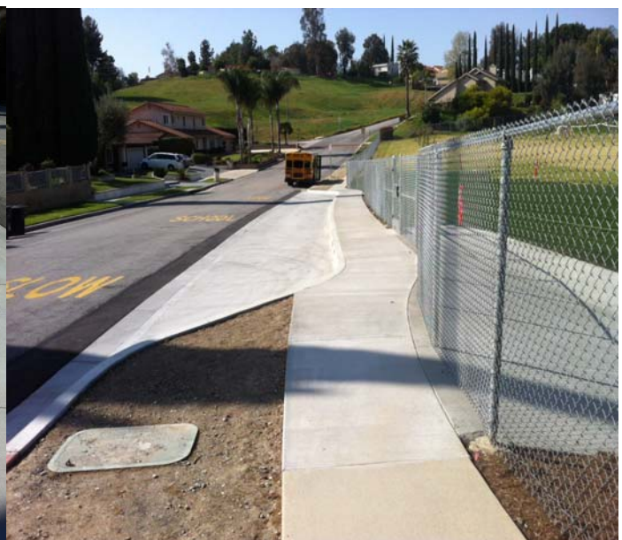
Completed bus drop off lane looking northwest.