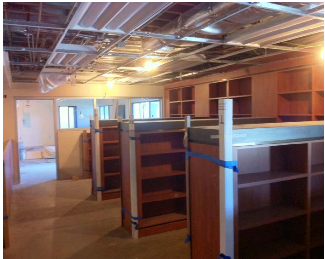
Library book shelves in progress.