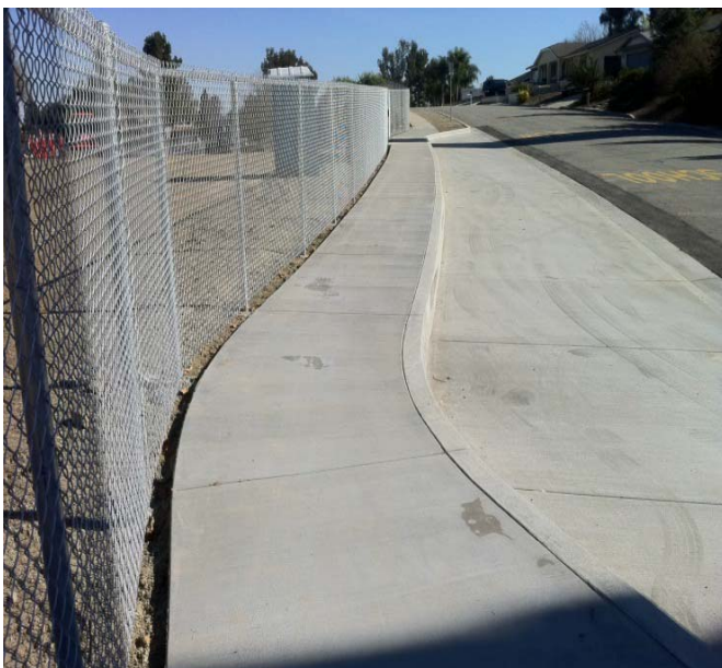
Completed bus drop off lane looking southeast.

Contract awarded to WCCR Construction. Project is 100% complete. NOC and final change order to be submitted/approved at the March 21, 2013 Board meeting.