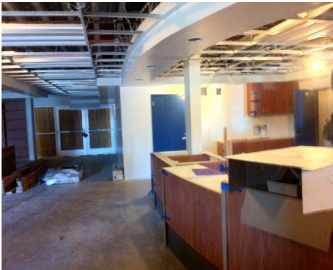
Library front desk in progress.

Status: Mechanical, electrical, plumbing rough-in is complete in building 'C' and 'D'. Casework installation in Building 'C' is in progress with only the countertops remaining. The t-bar ceiling grid is installed. The door and window frames are all installed. All hollow metal doors and hardware are installed. Drywall patch back is complete in Building 'D'. The plaster color coat has been completed. Project is 90% complete.