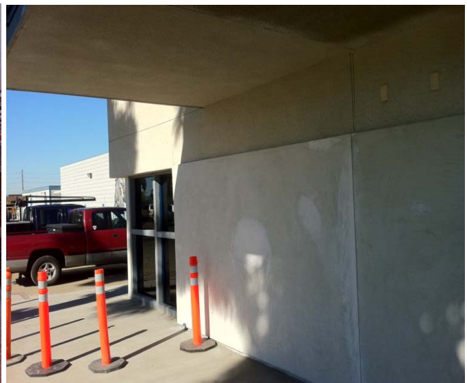
Plaster color coat and exterior glazing complete.