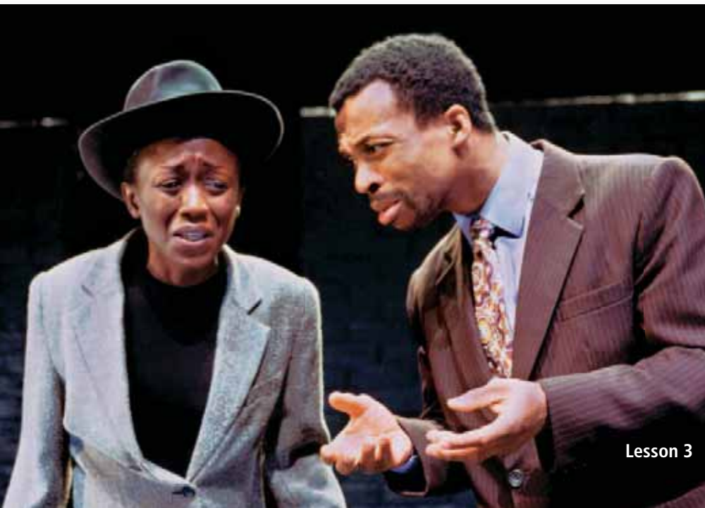
■ Figure 3.9 Actors portray strong emotions by using body language and changing their tone of voice. How might an actor use body language to convey each of the emotions described above?

Explain How do hormones affect emotions?