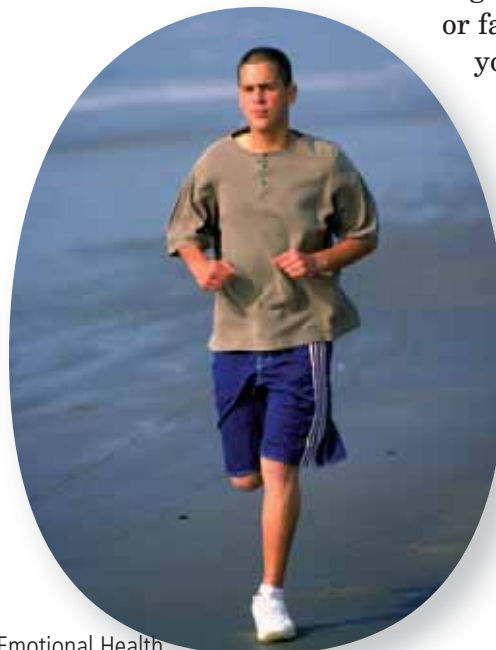
■ Figure 3.12 Physical activity is a healthy way to use the energy that can build up with anger. Which strategy for dealing with anger would you most likely use?

Explain How do people use defense mechanisms?