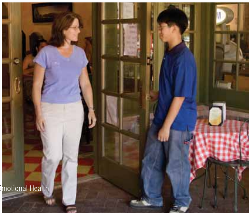
■ Figure 3.6 Courtesy is a sign of respect. How do you show respect for others?