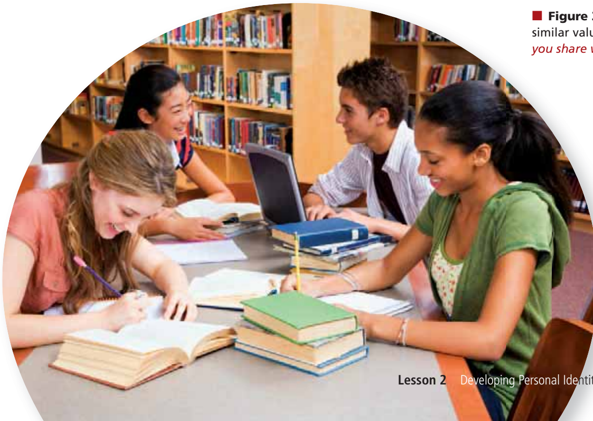
Figure 3.5 Friends share similar values. What values do you share with your friends?

An important aspect of your identity is your character , the distinctive qualities that describe how a person thinks, feels, and behaves . Good character is an outward expression of inner values and is a vital part of healthy identity. A person of good character demonstrates core ethical values , such as responsibility, honesty, and respect. Such values are held in high regard across all cultures and age groups.