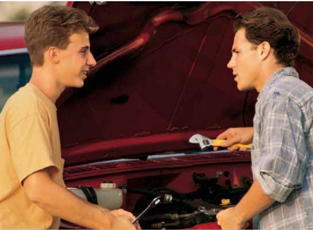
■ Figure 3.2 Important people in your life play a role in shaping your self-esteem. How has someone important to you affected your self-esteem?