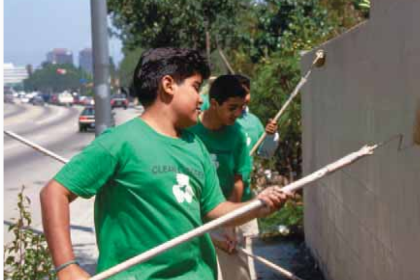
■ Figure 3.4 These teens have found a way to contribute to their community. Why do you think taking time to attend to the needs of others is beneficial to self-esteem?

Try using Maslow's model to evaluate your personal development. What needs are you focused on right now? How are you meeting those needs? As your self-awareness grows, you can begin to take more control of your personal growth. Reaching out to others can help you develop deeper relationships and a stronger support group.