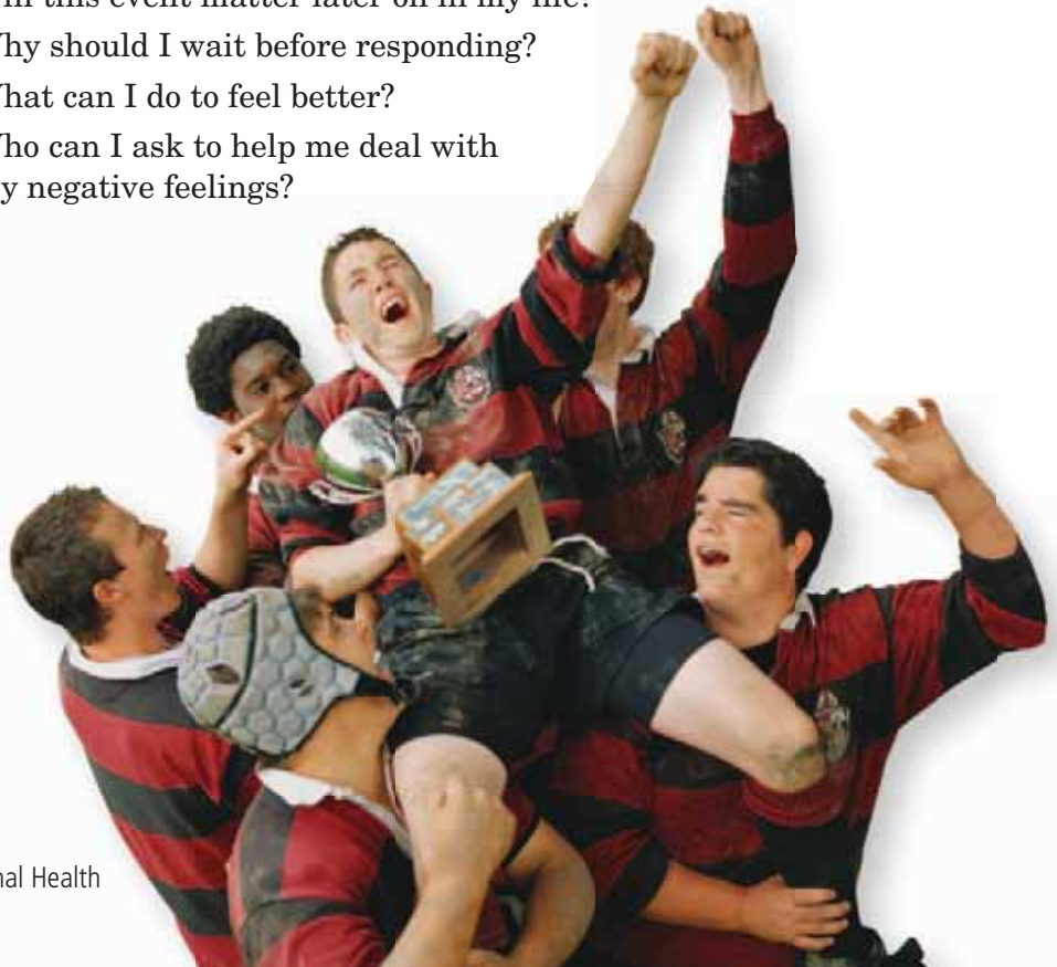
■ Figure 3.10 Healthful expression of feelings lets you enjoy life more. What are some positive ways to express emotions?