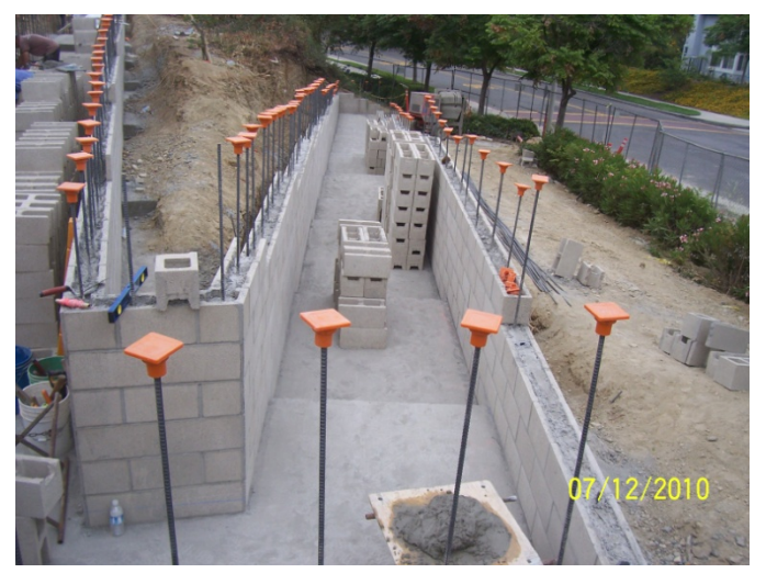
3. CMU Wall In Progress. First Grout Lift Complete.