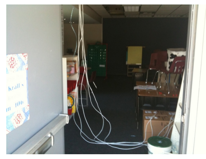
2. Pulling cable @ Country Springs.

1. Data jack installations @ Butterfield.