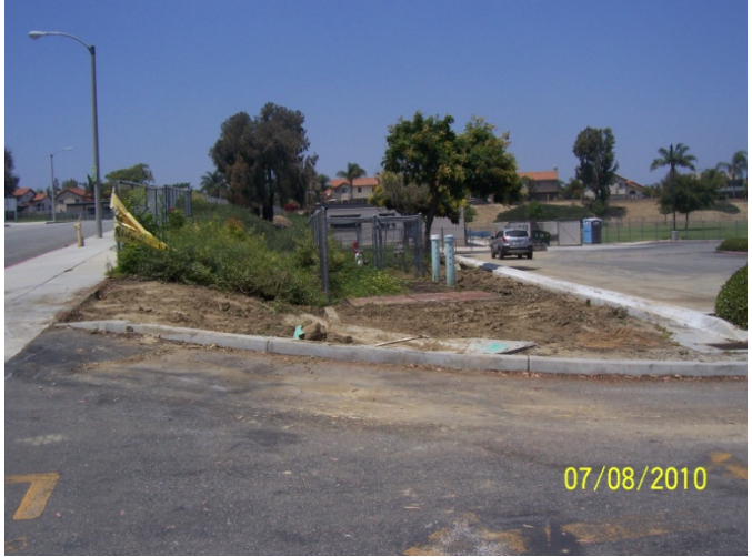
4. Rolling Ridge - Hard Demo Complete.

3. Butterfield Ranch – Grubbing and Grading Complete.