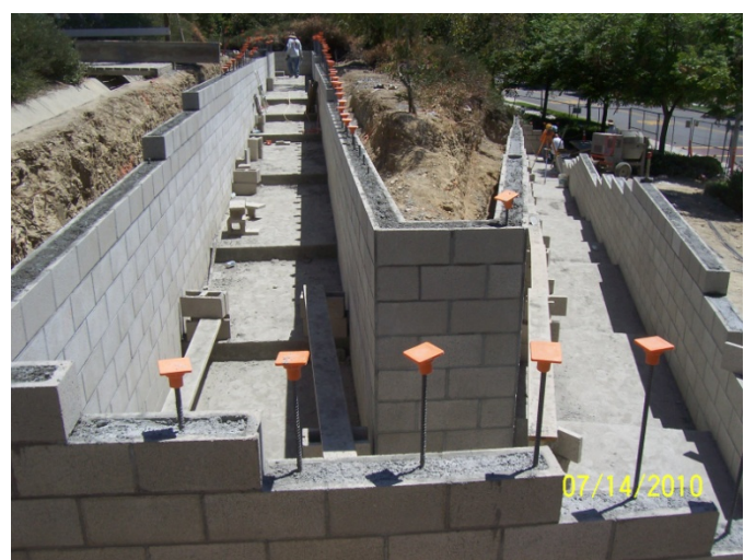
4. CMU Wall Complete and Fully Grouted..