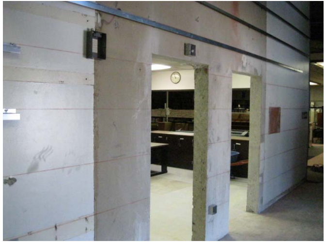
4. Interior modernization in progress.