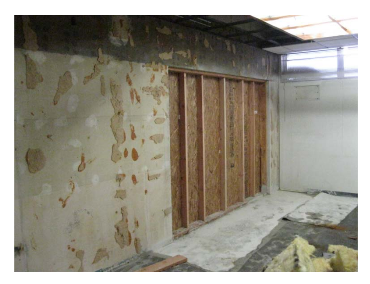
1.Demo for new double door entrance complete.

Status : Dalke and Sons continues to work on the following activities: The fence post footings have been dug. The ramp and steps at the entrance have been dug and are concrete formwork is in progress. Interior concrete wall demolition has been completed. Framing is nearly complete. Storefront has been demo'ed, while the deffered approval for the storefront has been sent to DSA for approval.