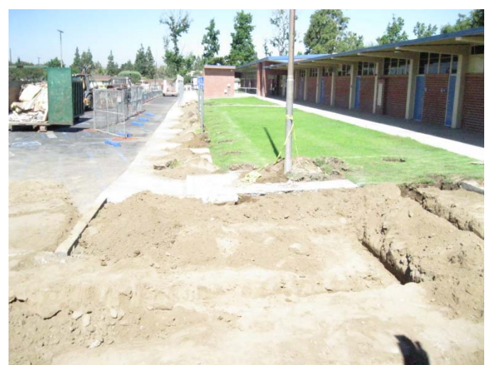
2. Future ramp location.