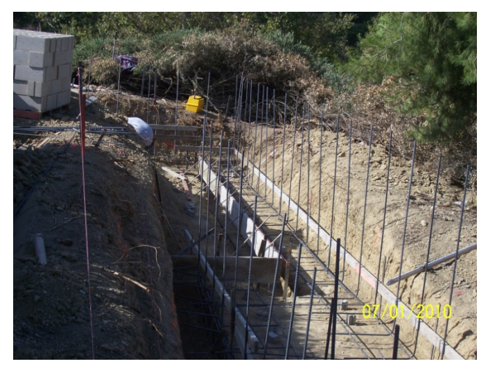
1. Footings Formed and Rebar Installed.

Status : Footings have been poured and CMU walls are up and fully grouted. The storm drainage and waterproofing installation is in progress.