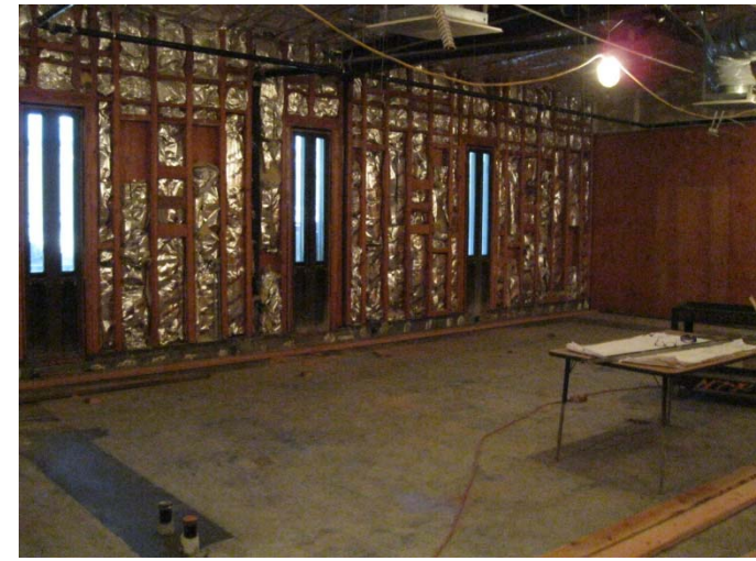
4. Demo at science labs in progress.