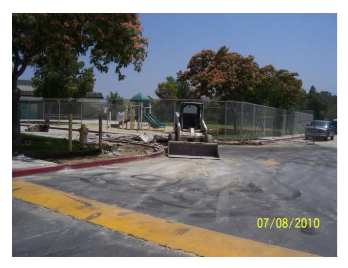
1. Country Springs - Hard Demo.

Status : Butterfield Ranch: Grubbing and grading has been completed. Hard demo is complete. Electrical rough-in is currently in progress. Country Springs: Hard demo is complete. Grubbing and grading at shelter area is currently in progress & library demo complete. Rolling Ridge: Hard demo is complete.