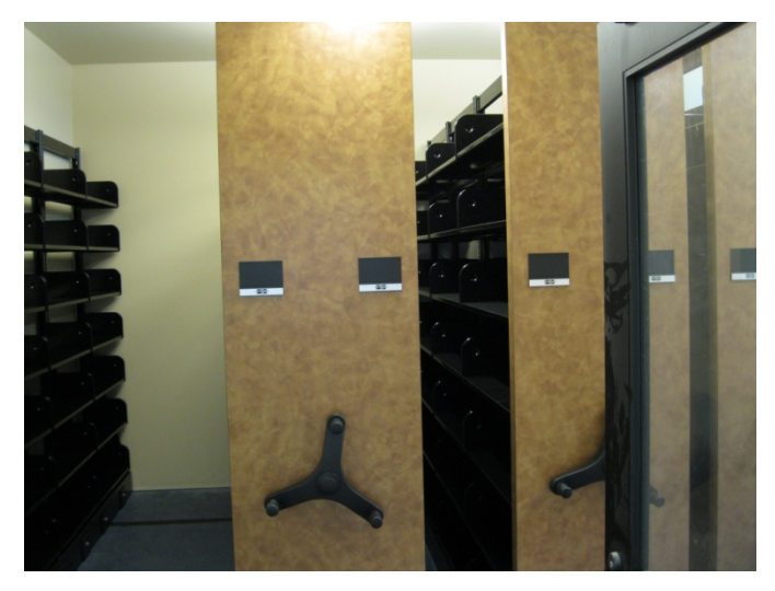
1. Exterior complete