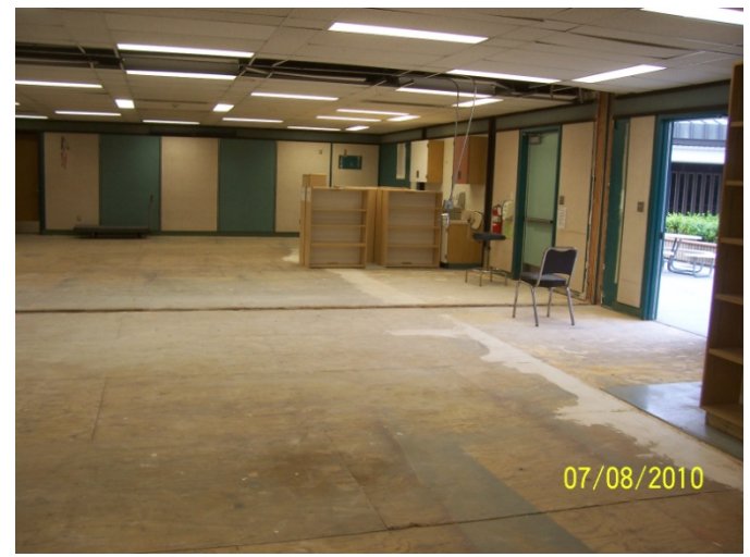
2. Country Springs - Library Demo Complete.