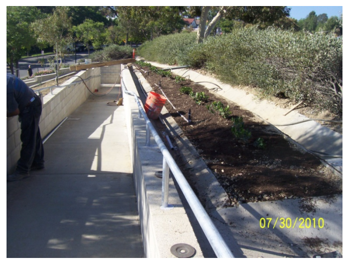
2. Completed Ramp from Top.