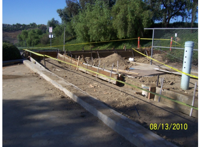
4. Rolling Ridge - Ramp ready for concrete pour.