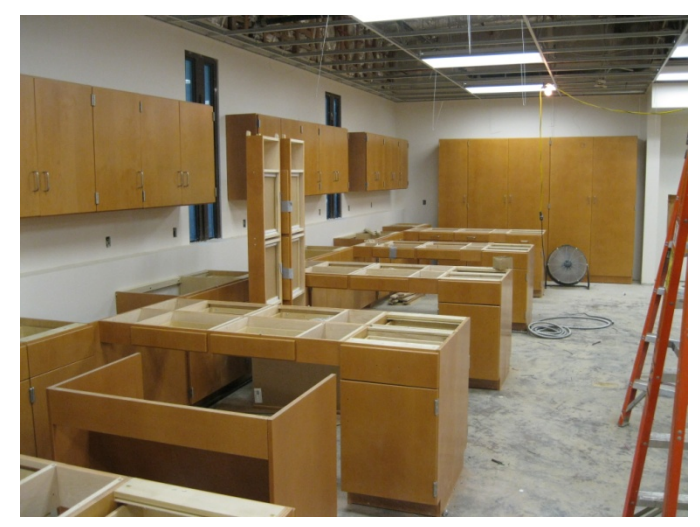
4. Science labs in progress.