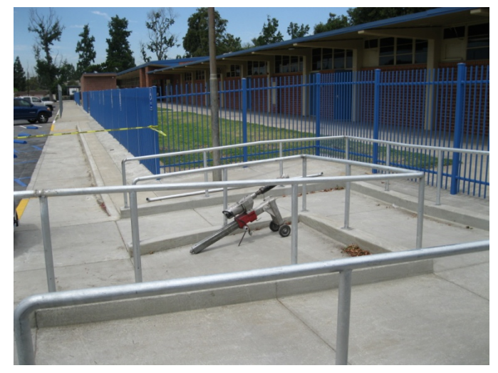
1.Front entrance steps complete.