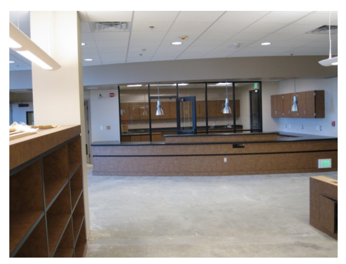
3. Library in progress.