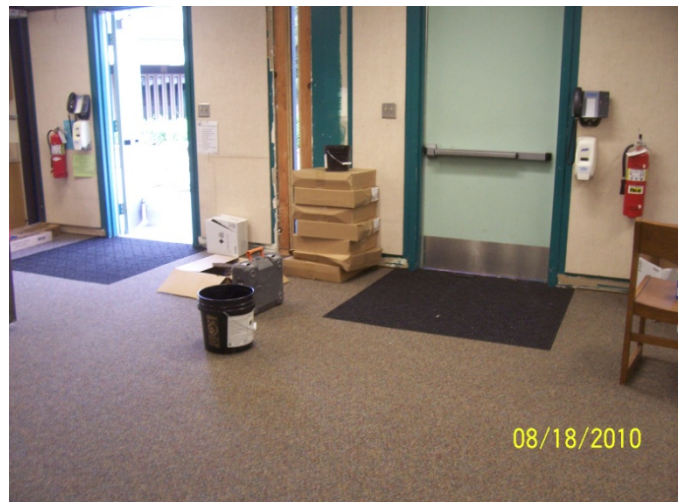
2. Country Springs - T-bar and Carpet complete.

3. Butterfield Ranch - Paved and ready for Shelter.