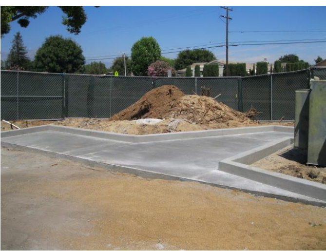
2. Completed concrete placement for accessible curb and ramp.