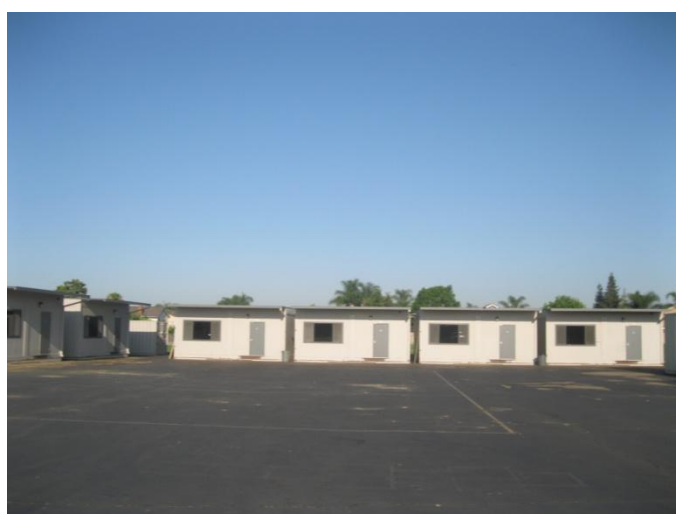
2. Completed portable building placement.