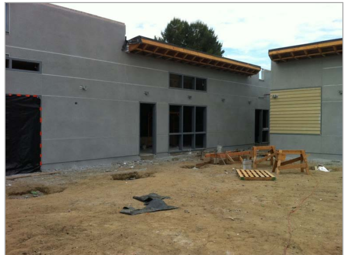
2. South Building and Canopy Footings in Progress.