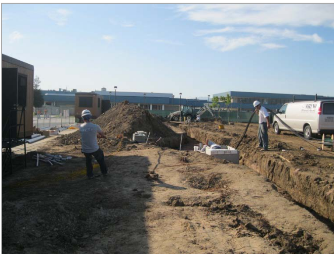
3. Power and Data Ductbanks relocated, slurried and backfilled. Wiring/cabling pulled and reconnected.