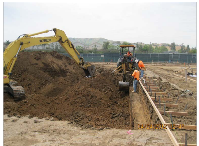
4. Excavation of Pool nearly complete.