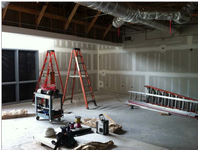
1. Interior Progress at South Building.

Status: Pacwest Corporation has completed the scratch, brown and color plaster coats. The single-ply roofs have been installed. All mechanical units have been installed. All drywall has been hung and taped. MEP rough-in is complete at all three buildings. Interior finishes will begin to be installed in the next week.