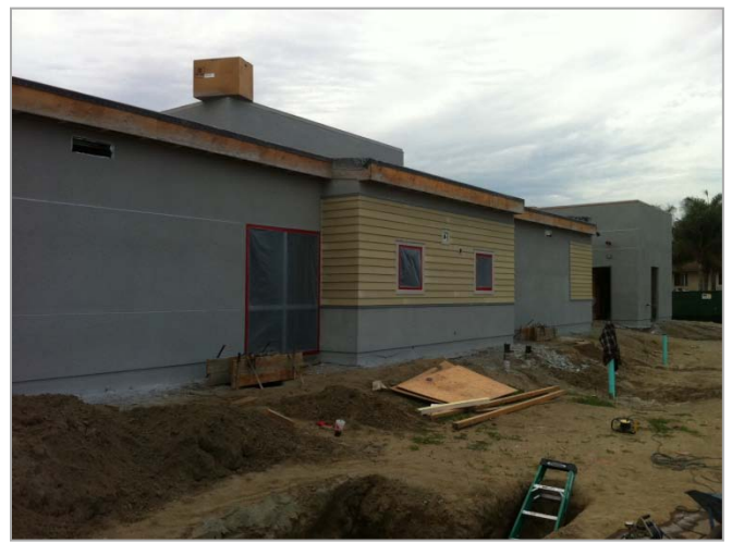
4. West Side of the West Building in Progress.