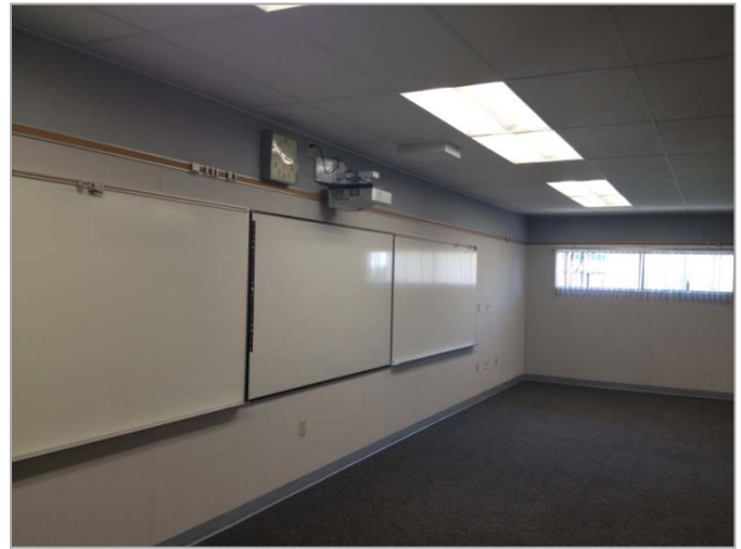
2. Installation of the new interactive whiteboard, projector, light fixtures, and ceiling tile.-Phase Seven