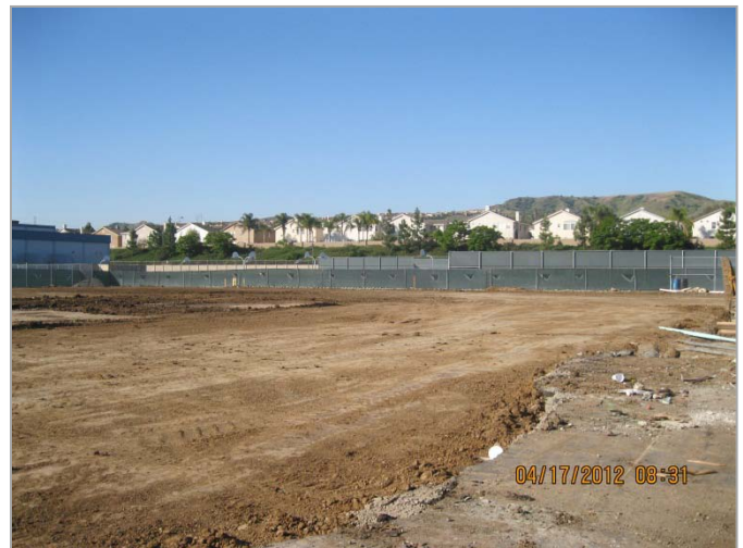
2. Building pads overexcavated, backfilled and compacted.