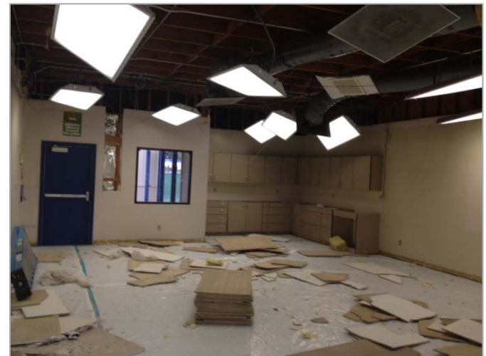
4. Selective demolition of existing ceiling tile, insulation, light fixtures, blinds, and countertops.-Phase Eight