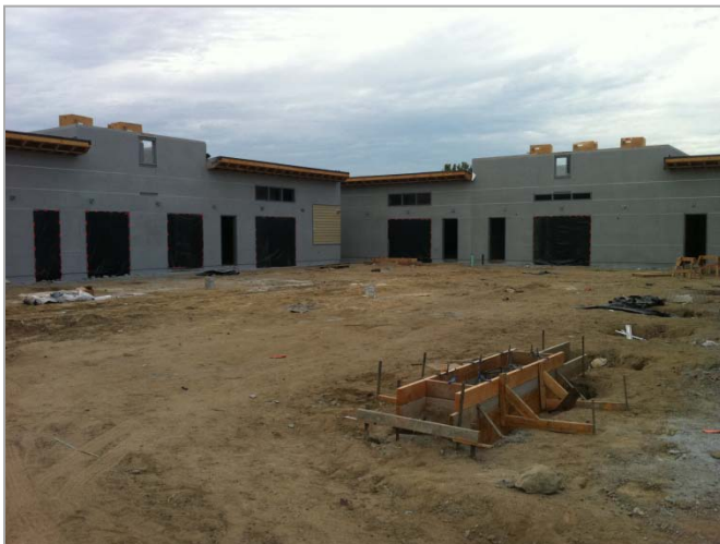
3. Picture of the Courtyard in Progress.