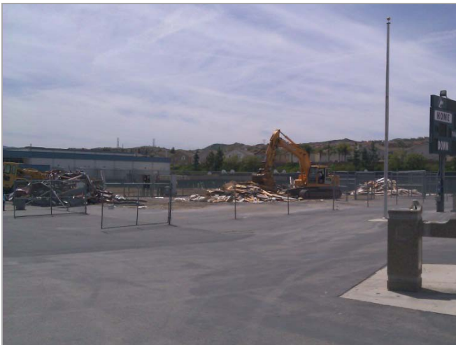
1. Grubbing and demolition complete.

Status: Grubbing and demolition complete. Overexcavation, backfill and compaction of building/bleacher shade structure pads complete and elevation certified. Main power and data ductbanks from Administration Building to Transformer Enclosure complete with wire/cabling pulled and connected. Stadium Fire Alarm and Data repulled and reactivated. Excavation of Pool 80% complete.