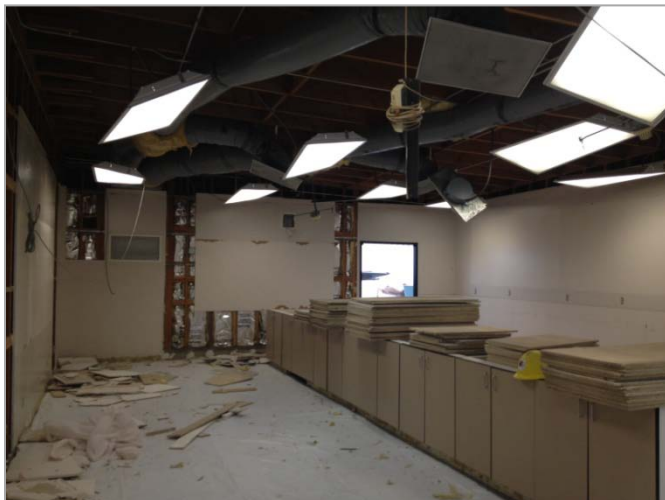
3. Installation of floor protection and selective demolition of existing base, ceiling tile and grid, and casework.-Phase Eight