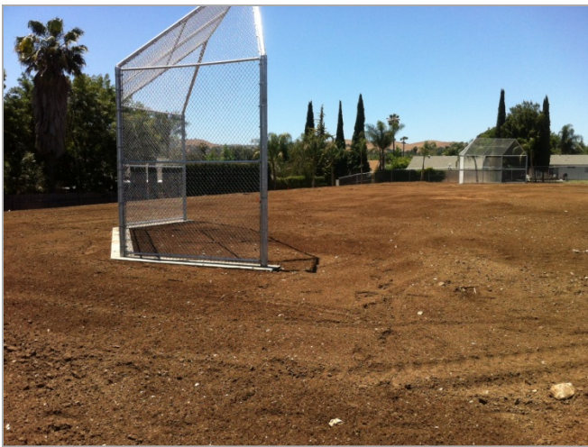
1. Backstops installed at new field.

Status: The slopes against the northwest school property line have completed. The final grade of the entire field is now set. All concrete walkways and swales have been placed. All fencing and backstops have been installed. Irrigation at the main field is complete. All that remains is the hydroseeding of the field.