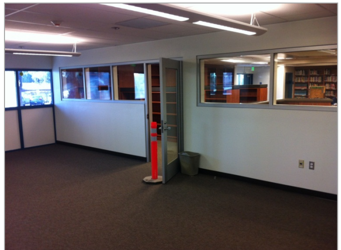
4. Computer lab complete.