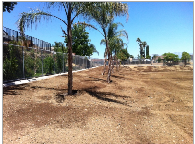
2. West property line complete and ready for hydroseed