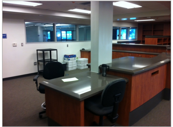
2. Librarian desk complete.