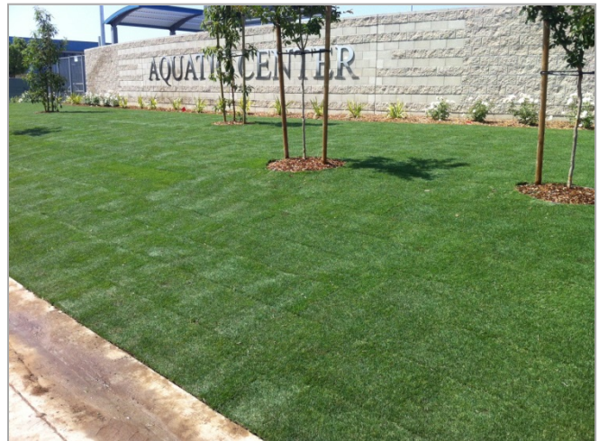
2. Landscaping at front complete.