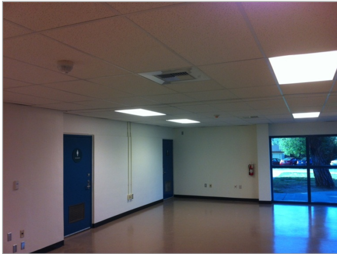
1. Teacher's lounge expansion complete.

Status: All work has been completed and punch lists issued. Punchlist corrections are nearly complete in all areas. Once the remaining punchlist items are corrected, the Notice of Completion will be signed by all and brought to the Board for approval.