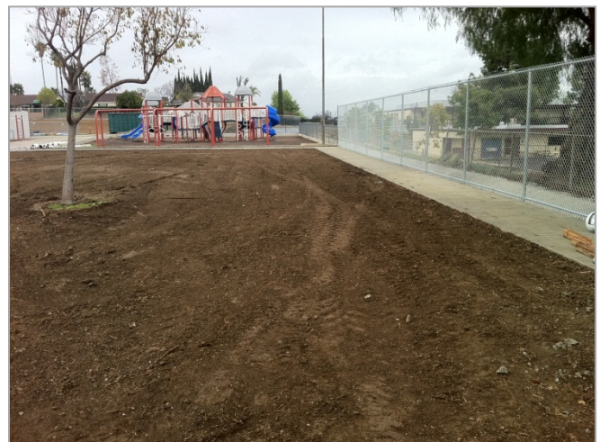
4. New walkway to playground equipment complete.