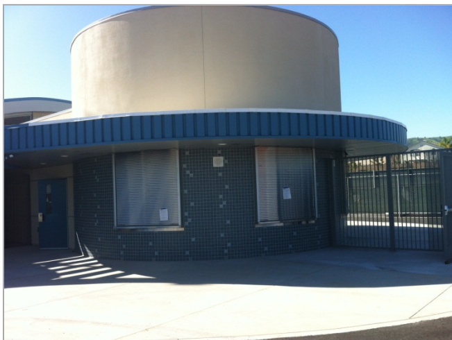
3. Concession building exterior.