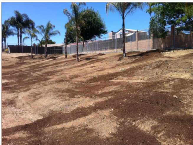
3. North slope complete and ready for hydroseed.