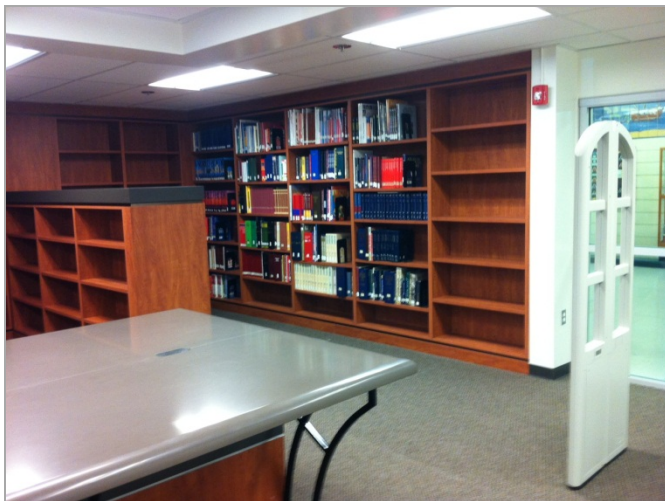
3. Move to new library complete.