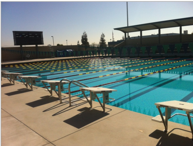
1. Pool is ready and in use.

Status: Work on the new water line is nearly complete. The water meter has arrived and the water line work is scheduled to be completed the week of 5/20/13. The landscaping in the front is now complete and in the maintenance period. All other work on the project is now complete. The punch list has been issued with the majority of items addressed. Once the remaining work and punchlist items are corrected, the Notice of Completion will be signed by all and brought to the Board for approval.