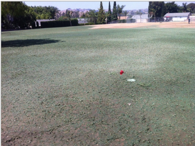
3. Hydroseeding at the field in progress.