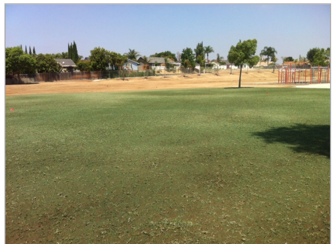
4. North portion of the field hydroseeding in progress.