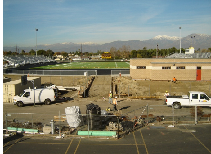
3. Site overview- work in progress.