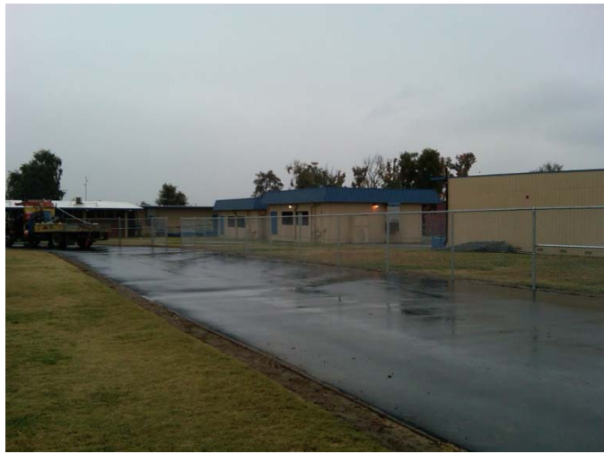
2. New chain-link fence and double gates east of Science Lab. #3.