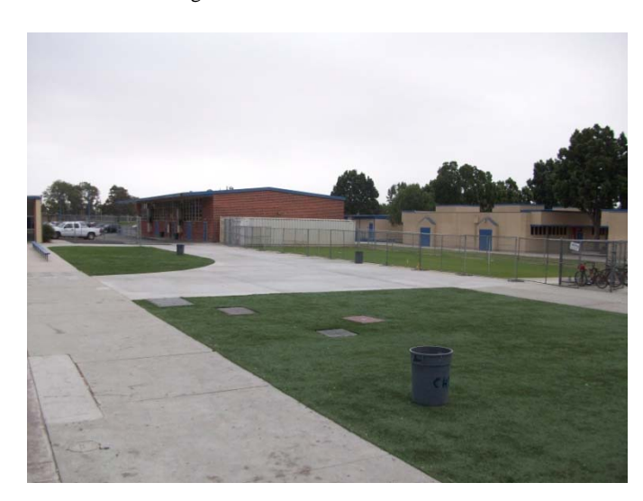
3. New concrete fire lane and hydroseed planter complete.