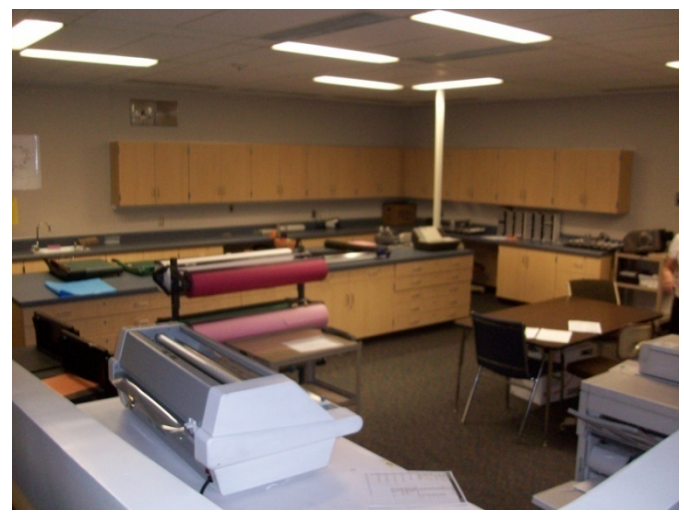
2. Building A- Occupied work room.