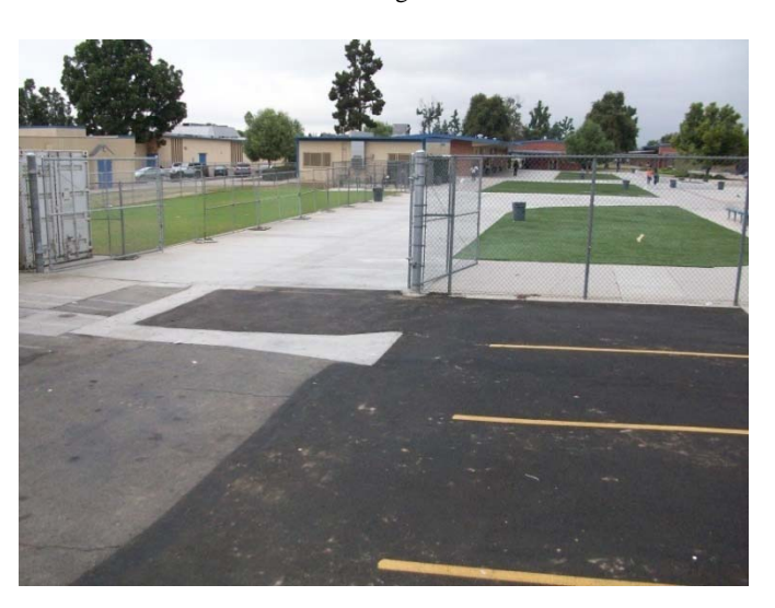
4. New double gate for fire department access complete.