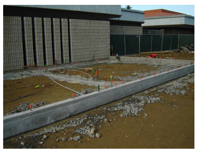
4. Footings stripped, ready for slab-on-grade.