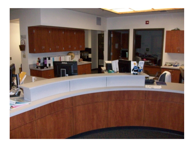
1. Building A- Occupied front desk.

Status: HCH has substantially completed construction at building A. Remaining work to be completed: wheel chair lift, door hardware, site lighting and punch list items.