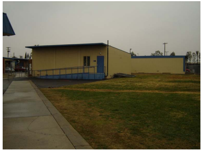
1. Removed existing chain-link fence south of Science Lab. #3.

Status: KAR has completed the final phase (phase 5) of the project and the school's staff has occupied the following buildings: counseling, home economics and multi purpose room ('MPR'). Installation of the new concrete fire lane, new double gate for fire department access is complete, removal of existing chain-link fence south of the Science Lab. #3 is complete, installation of new chain-link fence east of the Science Lab. #3 is complete, fire alarm system is complete and punch list is complete. KAR Construction has demobilized from the project.