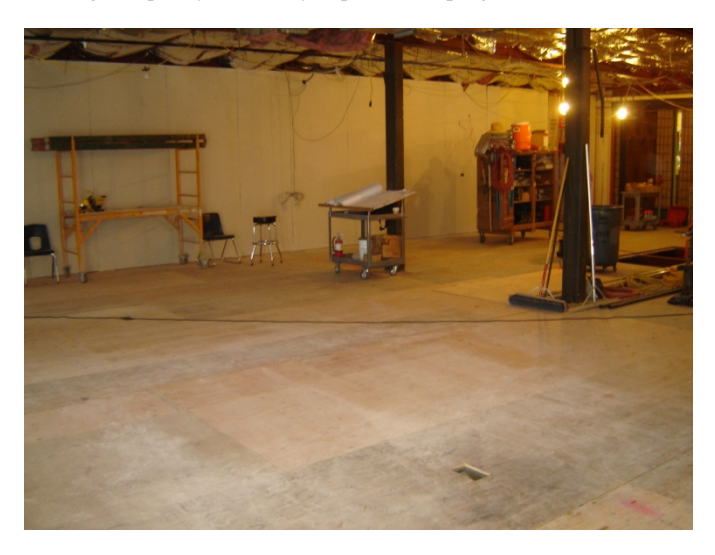
4. Plywood flooring re-installed, drywall hung.