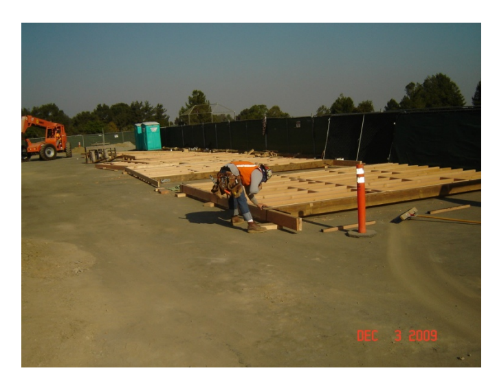
1. Exterior framing in progress.

Status : JRH Construction has continued to work on the following activities: Exterior rough carpentry is currently in progress. Interior demolition has been completed. The plywood flooring has been reattached to the Z-purlins. Drywall has been hung after blocking was installed.