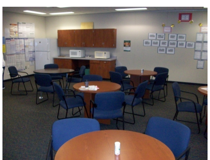
3. Building A- Staff lounge complete.