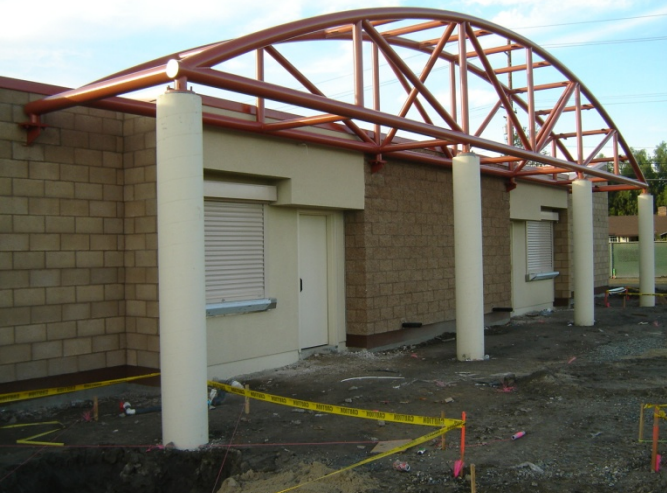
4. East side of building A.