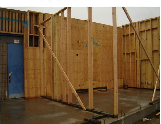
3. Rough carpentry for library expansion in progress.