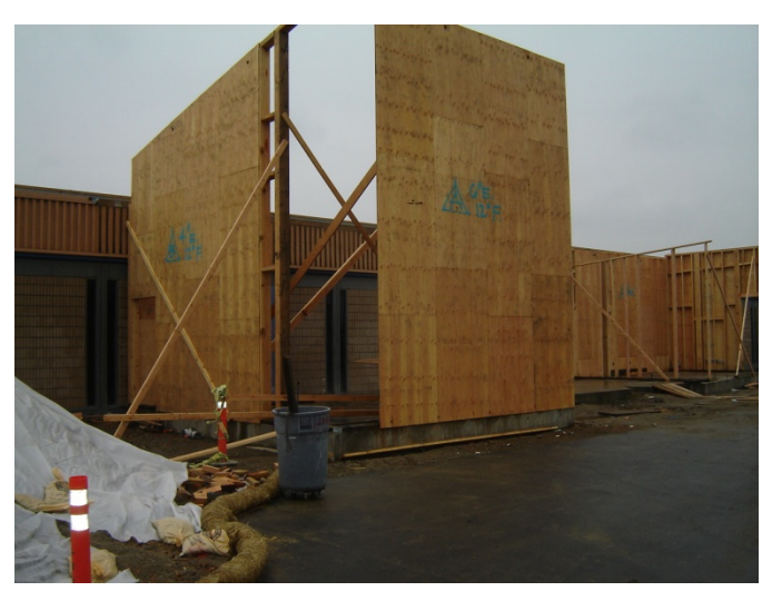
2. Rough carpentry for library expansion in progress.