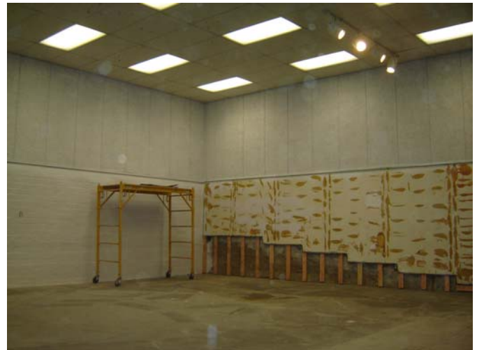
2. Bldg. P- Interior concrete slab were poured, wall repairs on-going.