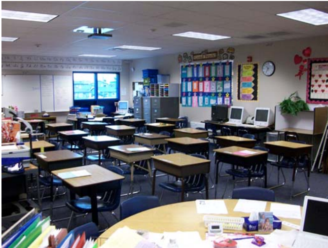
1. Bldg. K- Furniture and equipment was moved into classrooms.

Status: The contract completion date was extended from March 6, 2009 to March 20, 2009 due to additional work for the sewer line installation. Meadows continued construction of the new Classroom Building with the following activities: installation of countertops was completed, plumbing fixtures inside the building were installed, exterior drinking fountain was completed, HVAC system, installation of the energy management system ('EMS') and low voltage systems were completed. The school's staff occupied the new building on January 31, 2009. Remaining work to be completed: final roofing coats, final asphalt sealer and asphalt markings at the ball walls, and relocation of (6) existing portable buildings.