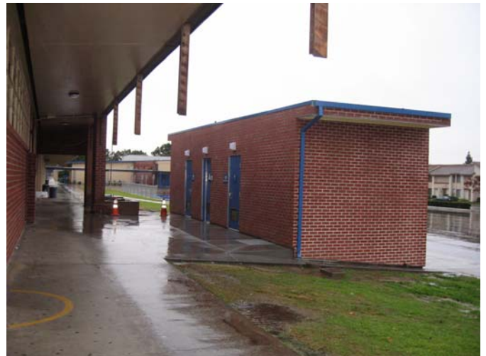
4. Completed Restroom Building in-front of the school.