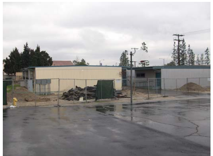
4. Six existing portable classrooms to be relocated to other schools.