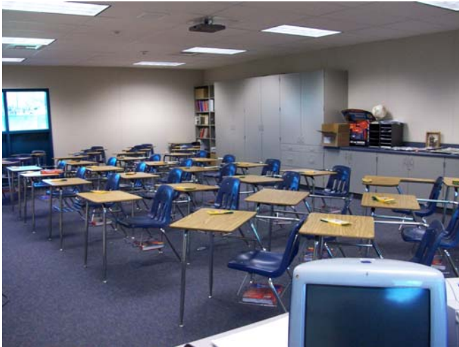
1. Bldg. X- Furniture and equipment was moved into classrooms.

Status: Meadows continued construction of the new Classroom Building with the following activities: HVAC system, installation of the energy management system ('EMS') and all low voltage systems were completed. A new motor control center ('MCC') outside the kitchen was installed and new chain link gates were installed at various locations. The school's staff occupied the new building on January 20, 2009. Remaining work to be completed: replacement of defective steel doors and final roofing coats at building X, installation of ornamental gates at the school's main entrance, demolition of (8) existing portable classrooms, proper disposal of light fixture ballasts and air conditioning bard units.