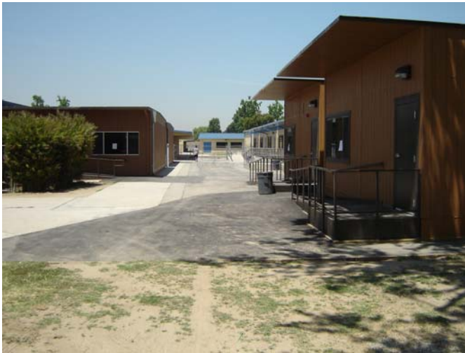
1. Completed Interim Housing units

Status: R. Jensen and Mobile Modular completed all units. Notice of Completion approved at the 8/21/08 Board Meeting.