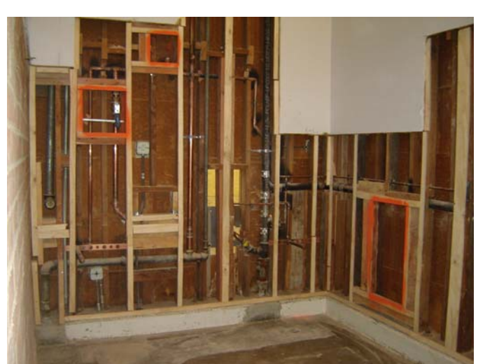
4. Bldg. P- Rough plumbing was completed at the girls' restroom.