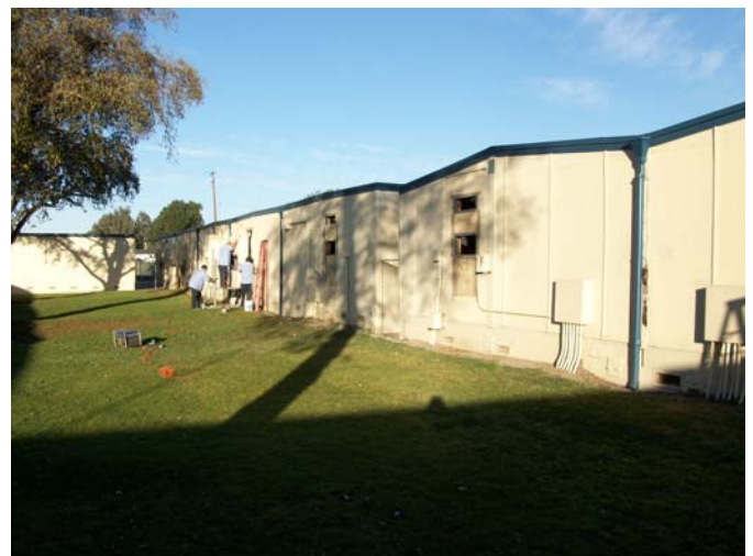
4. Removal of AC bard units outside portable classrooms.