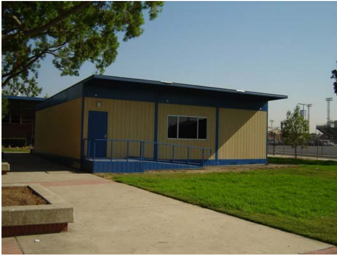
1. Completed Music Building.

Status: Permanent Relocatable Classrooms and Permanent Relocatable Restrooms were completed. Sitework at the restroom in front of the school has been completed. Notice of completion will be filed at the 02/19/09 Board Meeting.