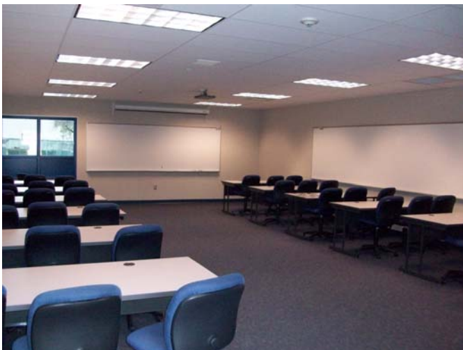
3. Bldg K- New furniture and projection screen installed.