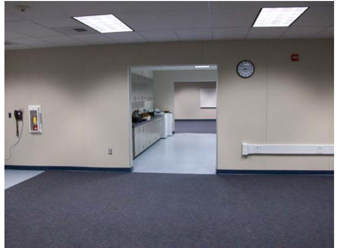
2. Bldg. K- New San Bernardino County classrooms and work area.