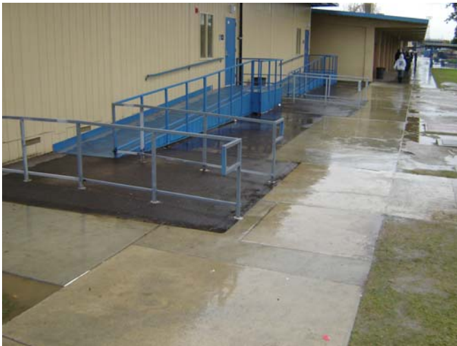
3. Completed Science Laboratories Buildings.