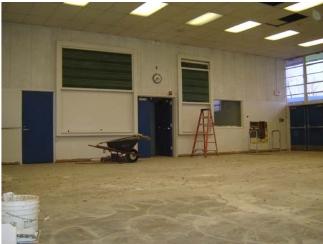
1. Bldg. P- New drinking fountain, painting and F/A are in progress.

Remaining work to be completed: installation of fire alarm pathways at various buildings. Phase 5 is scheduled to begin during the summer break of 2009. The following buildings will receive fire alarm and ADA upgrades: Home Economics, Counseling and Multi-purpose. Also, portable classrooms M1 thru M4 are scheduled to be demolished during this phase.