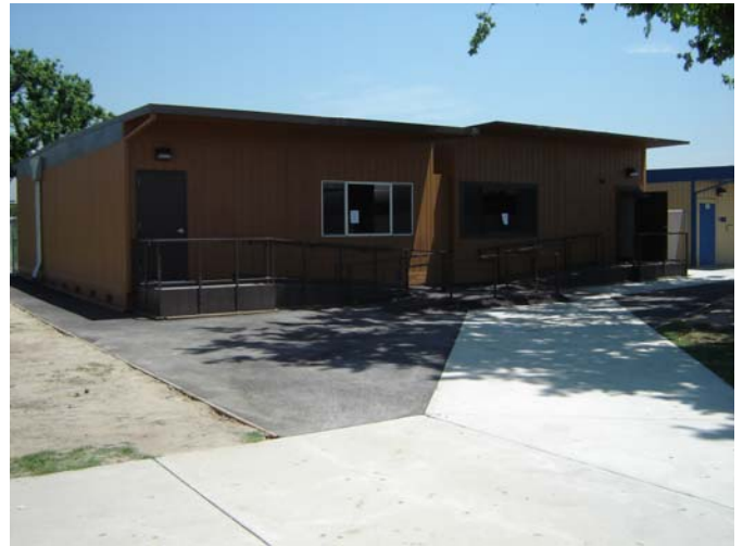
2. Completed Interim Housing units.