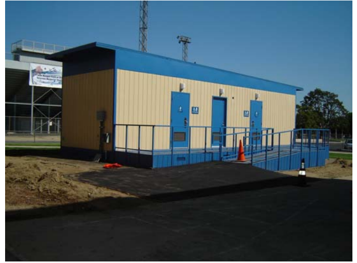
2. Completed Restroom Building.