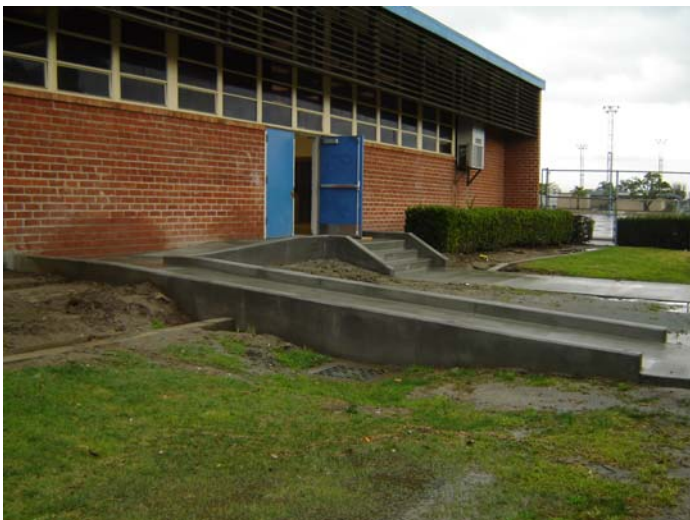
3. Bldg. P- Concrete was poured at new ADA ramp.