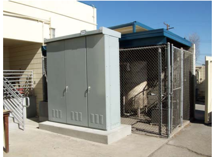
2. New MCC will operate the existing kitchen freezers/cooling boxes.