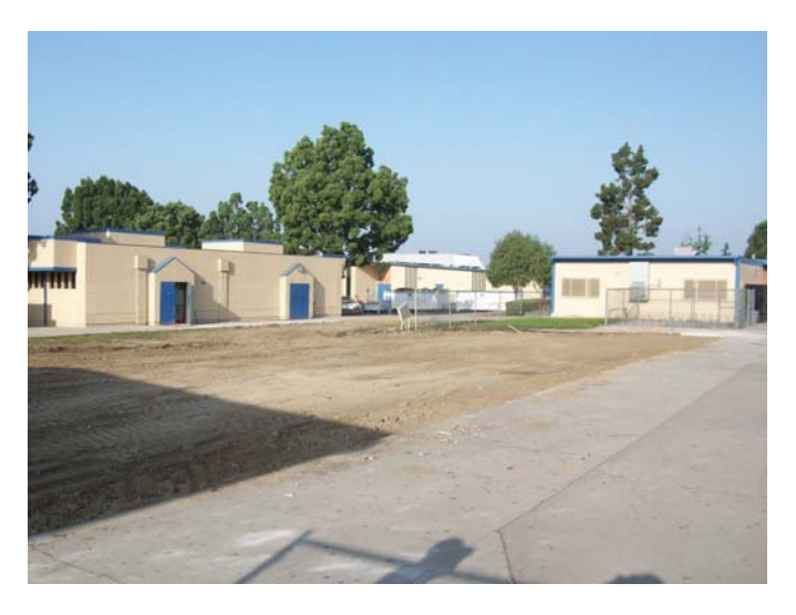
4. Portables M1 thru M4- Demolition work complete.