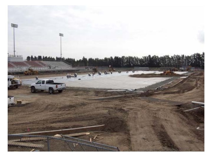
1. Ayala HS- Installing permeable system on the field.

Scope : (1) Installation of new Synthetic Field and Track surfaces at Ayala HS and Chino Hills HS, (2) Installation of new synthetic field surface at Chino HS, (3) Installation of new drainage system and supporting improvement in all sites. Status : Byrom-Davey continued construction at the following sites: Ayala HS permeable base is being installed in the field area, cooling system is complete, synthetic field turf installation to follow. Chino HS cooling system is complete, permeable base to follow. Chino Hills HS: Working on the cooling system, flat drain and permeable base installation to follow. Asphalt paving installation in track area will start this week.