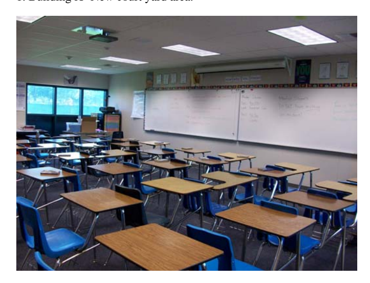
3. Building X- Occupied new typical classroom.