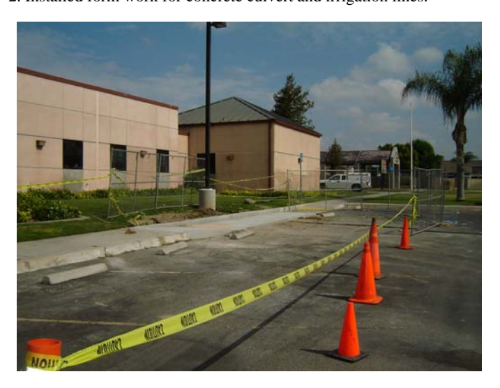
4. Installed new concrete ADA ramp.