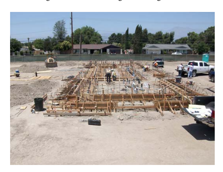
1. Building A- Form work and rebar complete, rough elect. on-going.

Status: Byrom-Davey completed the following activities: Over-excavation and recompaction under Building A (Concession), Building B (Team), Building C (Elevator) and the bleachers are complete. Over-excavation and recompaction of the field area is complete. Underground electrical and plumbing installations for Buildings A and B are in progress. Forms and reinforcing steel for Building A foundation has begun. Underground storm drain is on-going.