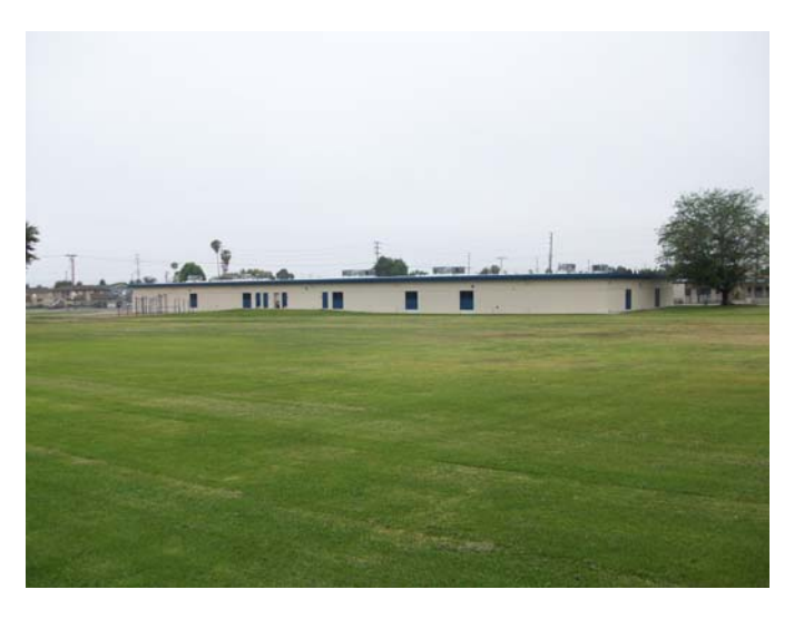
2. Building K- Site fence has been removed at the playfields.