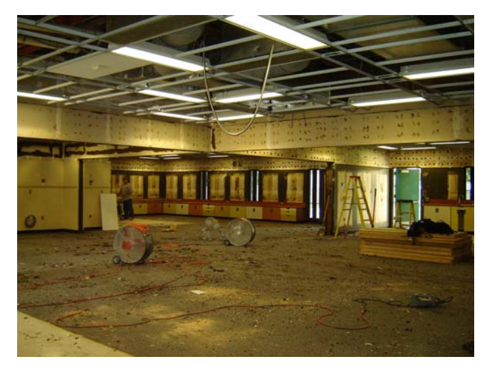
2. Removing existing ceiling tiles and wall siding.