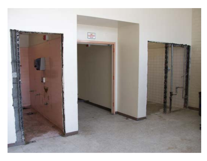
3. MPR building- Demolition work complete.