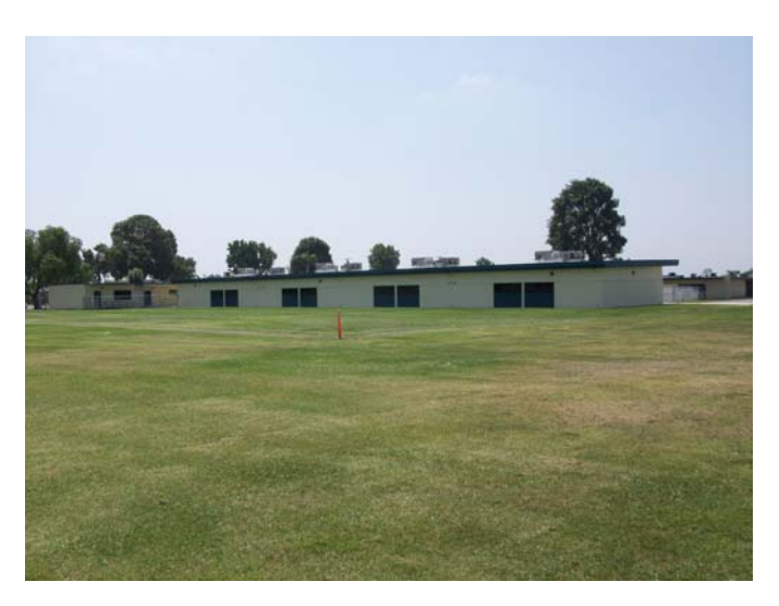
2. Building X- Site fence has been removed at the playfields.