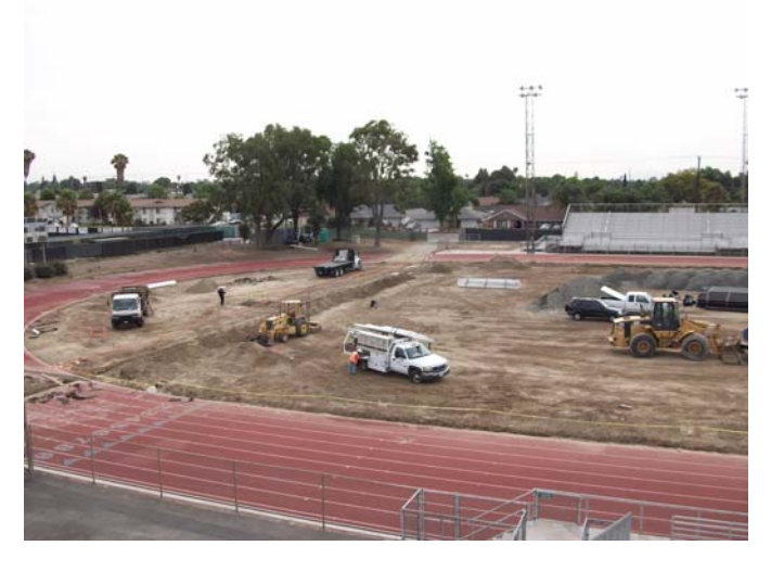
2. Chino HS- Installing irrigation lines to cool the field.