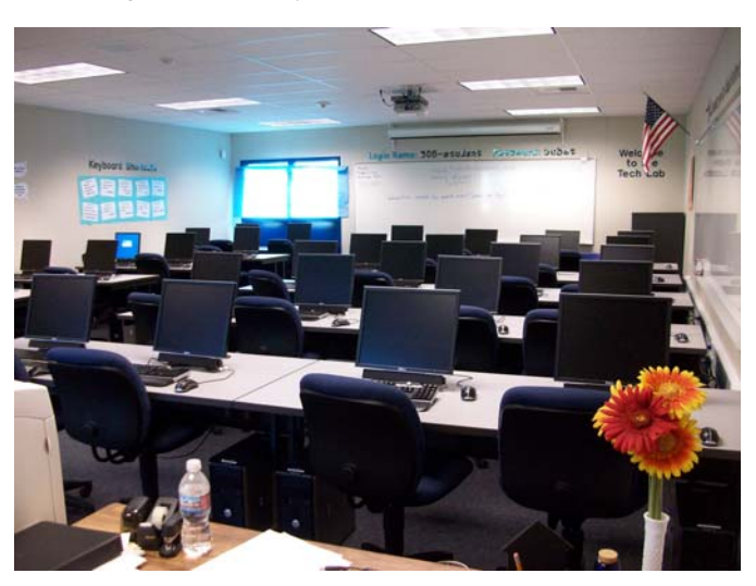
3. Building K- Occupied new computer lab.