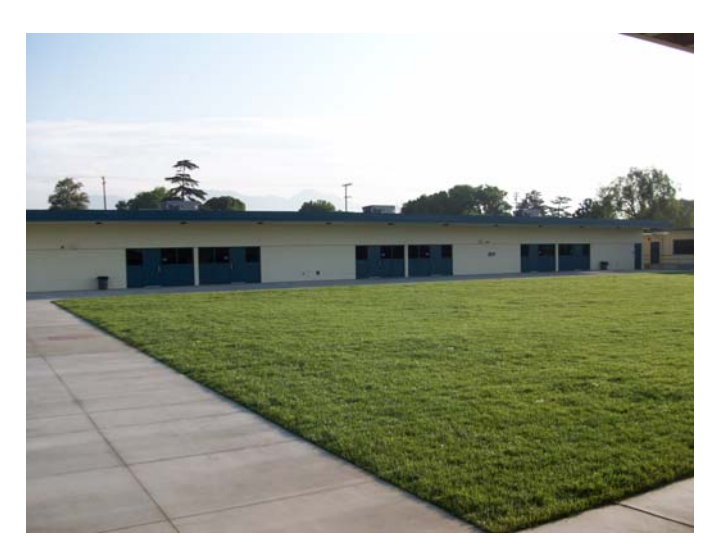
1. Building X- New court yard area.

Status: The contract completion date was extended from May 5, 2009 to June 19, 2009 due to additional underground electrical and low voltage systems. Meadows completed construction at the new classroom addition (building X) and modernization of locker room (building E) including punch list items. Site fence has been removed.