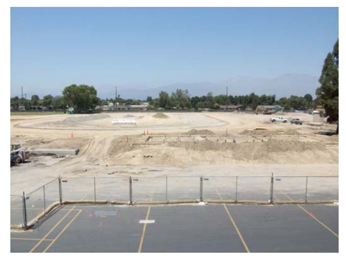
3. Site overview- Work in progress.