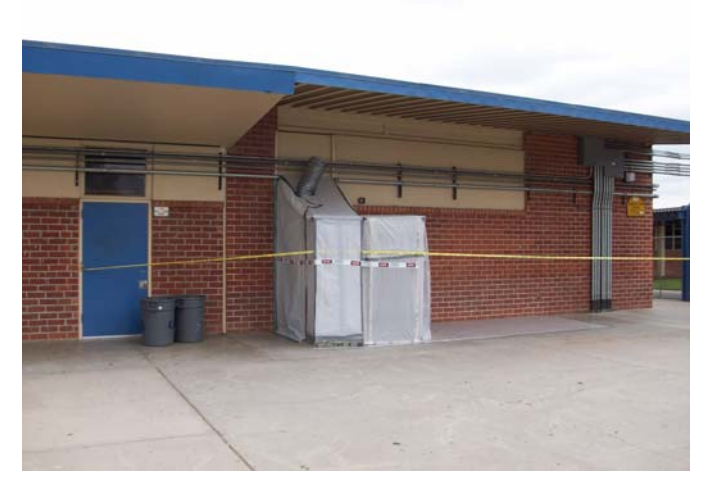
2. Counseling Building- Removal of VAT material complete.