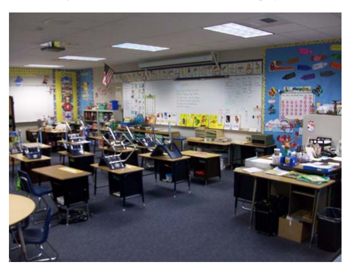
4. Building K- Occupied new typical classroom.