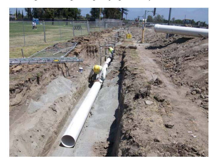
4. Installation of storm drain SDR-35 pipe on-going.