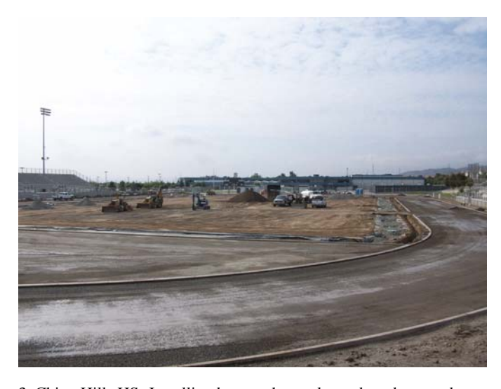
3. Chino Hills HS- Installing base at the track, ready to be paved.