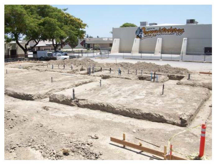
2. Building B- Building footings in-progress, ready to set form work.