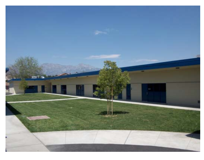
1. Building K- New court yard area.

Status: The contract completion date was extended from May 5, 2009 to June 19, 2009 due to additional work for the sewer line installation. Meadows completed construction at the new classroom addition (building K) including punch list items. Site fence has been removed.