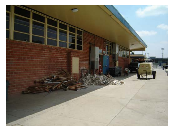
1. Home Economics Building- Demolition work complete.

Status: KAR completed phase 4 at the end of March 2009 and the school's staff occupied Building P. KAR mobilized on-site 06/15/09 and continued modernization with the following activities: set-up of temporary fencing, disconnected electrical, low voltage systems and demolished the existing portable Buildings M1 thru M4. Vinyl asbestos tiles ('VAT') were removed at the health office, existing exterior drinking fountains and restroom fixtures were removed at various buildings.