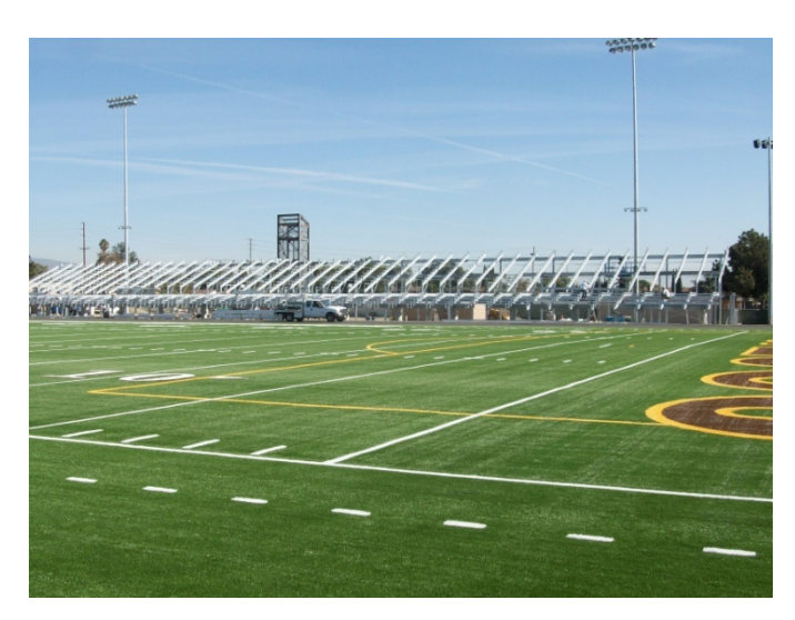
1. Field Turf installation complete.

Status: Byrom-Davey continued construction with the following activities: Field Turf installation for the football field has been completed. The bleachers are currently being installed. The structural steel for the elevator has been erected. The roofing and interior drywall for buildings A and B are both in progress. At the softball field, the walkways have been poured and the fencing for the dugouts has been installed.