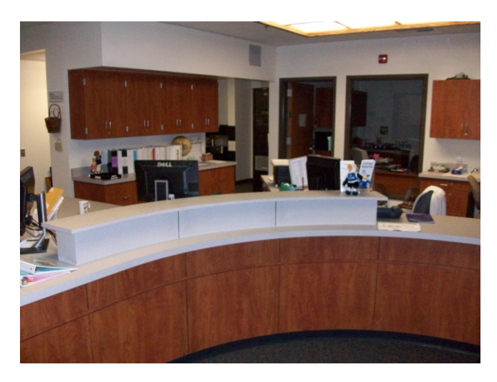
1. Building A- Occupied front desk.

Status: HCH has substantially completed construction at building A. Remaining work to be completed: wheel chair lift, door hardware, site lighting and punch list items.