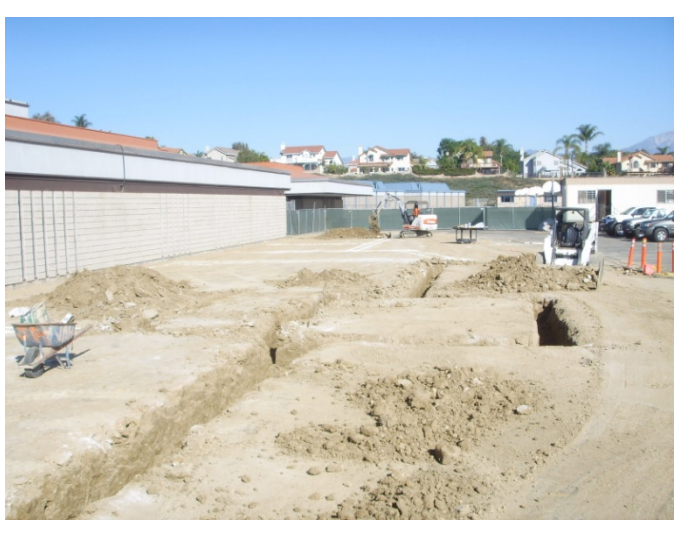
4. Footing excavation has begun.