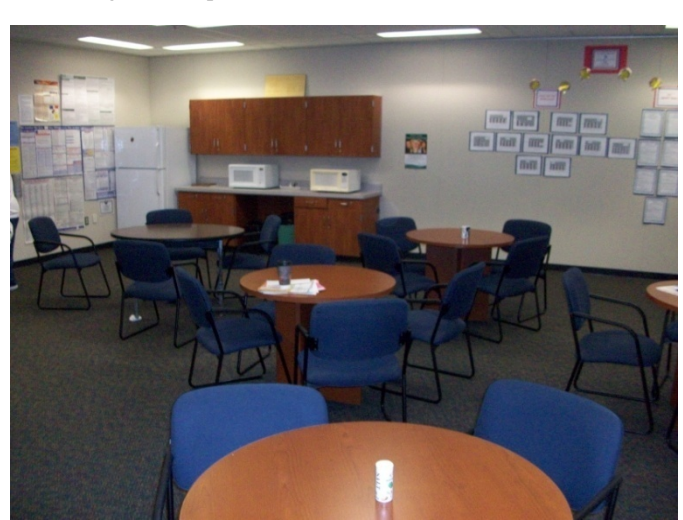
3. Building A- Staff lounge complete.