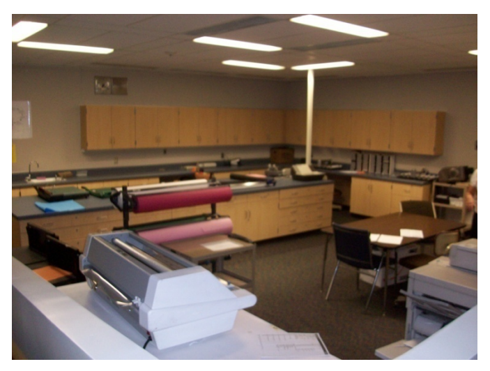
2. Building A- Occupied work room.