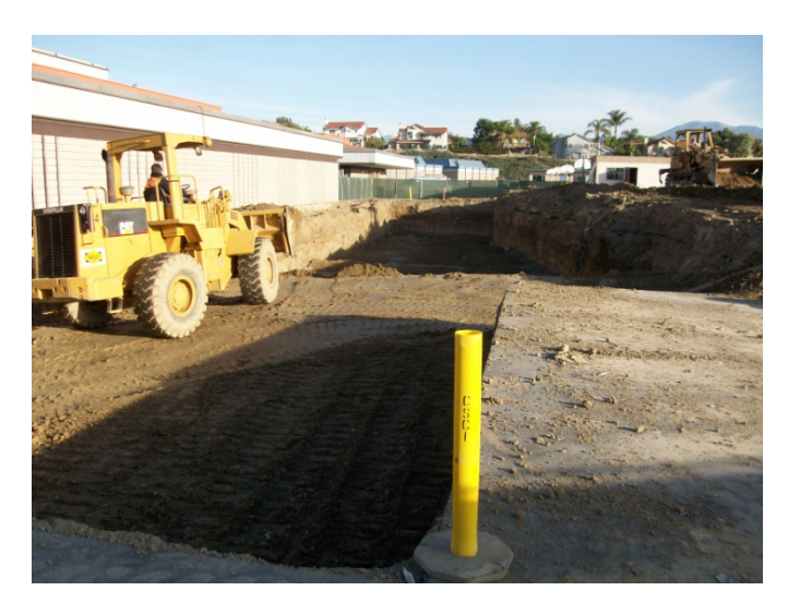
1. Backfilling the building pad.

Status : JRH Construction has begun work on the following activities: Over-excavation and soil backfill/compaction has been completed for the new library expansion. Slot-cutting and backfill along building has been completed. Footing excavation has begun.