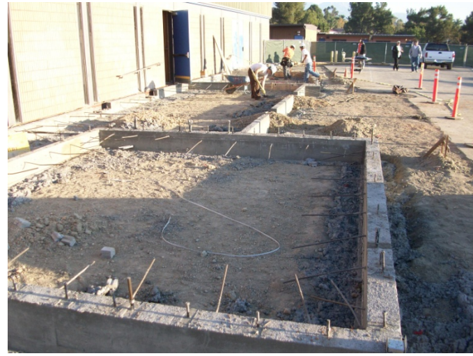
2. Footing forms stripped.