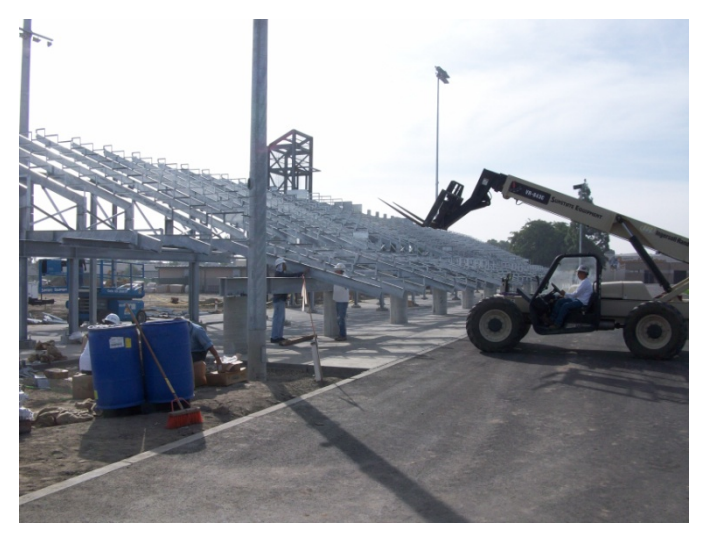
2.Bleacher installation in progress.