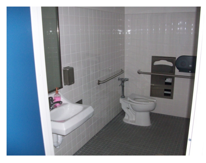
1. Home economic building new ADA unisex restroom.

Status: KAR has completed the final phase (phase 5) of the project and the school's staff has occupied the following buildings: counseling, home economics and multi purpose room ('MPR'). Installation of the new concrete fire lane and new gate for fire department access is complete, fire alarm system is complete and punch list is complete. KAR Construction demobilized from the project.