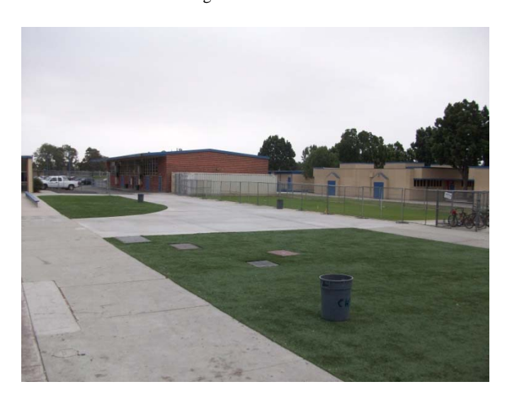
3. New concrete fire lane and hydrosed planter complete.