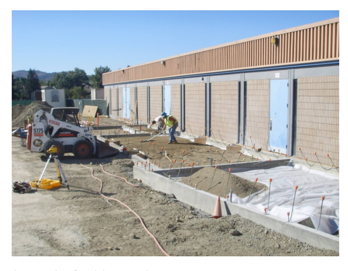
3. Preparing for slab-on-grade pour.