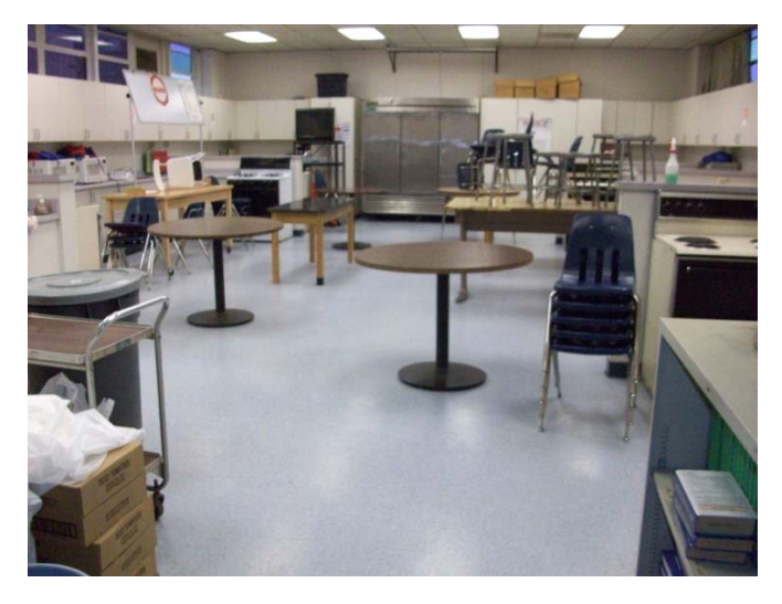
2. Home economic classroom occupied.