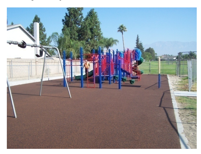
4. New playground equipment installed.