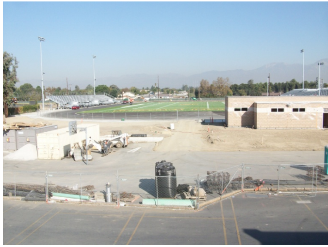
3. Site overview- work in progress.