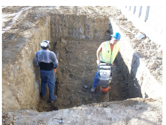
3. Soil compaction of slots.