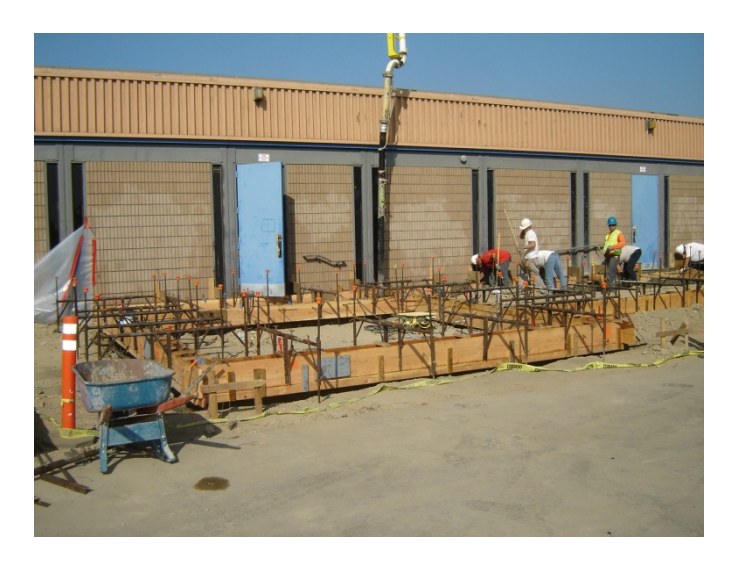
1. Footings being poured.

Status : JRH Construction has begun work on the following activities: Exterior footings have been poured and stripped. Sand has been placed over the vapor barrier in preparation for the slab-on-grade pour. Interior demolition has been completed. Interior footings are ready to pour.