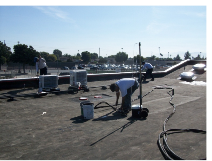
4. Roofing installation at building B.