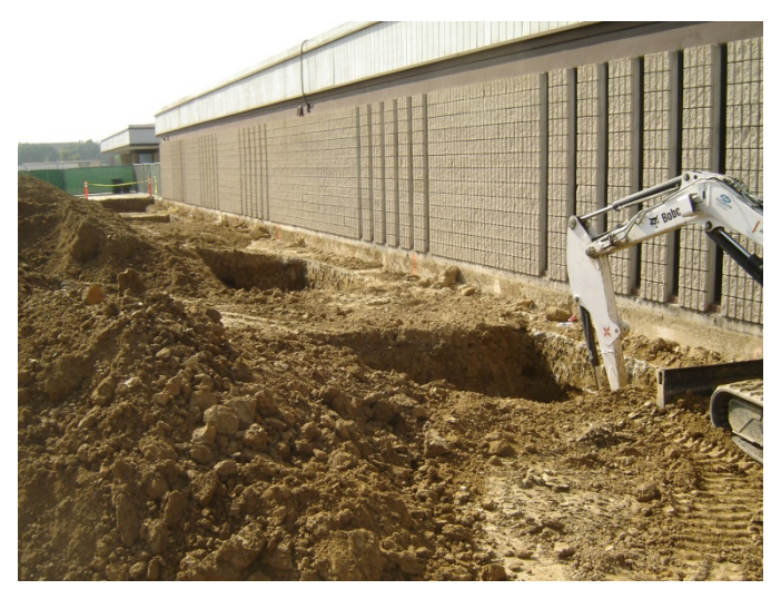
2. Digging the slots.