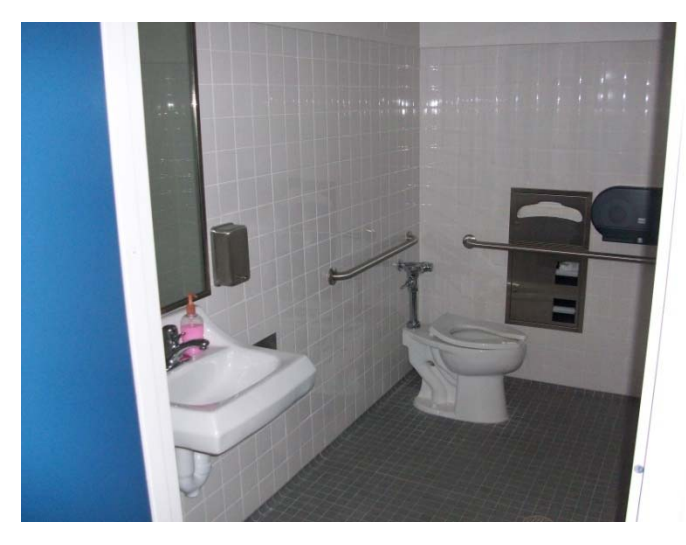
1. Home economic building new ADA unisex restroom.

Status: KAR has completed the final phase (phase 5) of the project and the school's staff has occupied the following buildings: counseling, home economics and multi purpose room ('MPR'). Installation of the new concrete fire lane and new gate for fire department access is complete, fire alarm system is complete and punch list is complete. KAR Construction demobilized from the project.