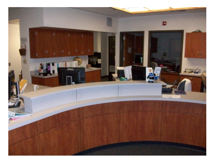
1. Building A- Occupied front desk.

Status: HCH has substantially completed construction at building A. Remaining work to be completed: wheel chair lift, door hardware, site lighting and punch list items.