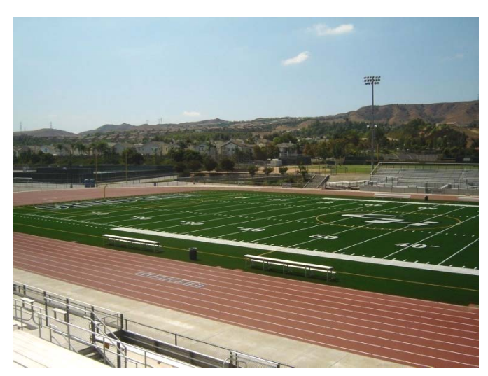
3. Chino Hills HS- New play field and track surfacing complete.