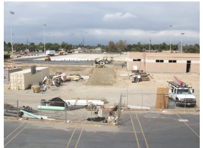
3. Site overview- work in progress.