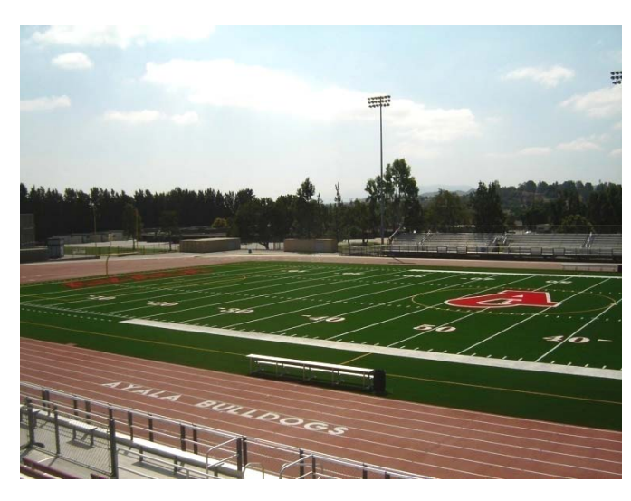
1. Ayala HS- New play field and track surfacing complete.

Scope : (1) Installation of new Synthetic Field and Track surfaces at Ayala HS and Chino Hills HS, (2) Installation of new synthetic field surface at Chino HS, (3) Installation of new drainage system and supporting improvement in all sites. Status : Byrom-Davey is substantially completed at Ayala HS, Chino Hills HS and Chino HS. All ADA upgrades in all restrooms and parking lots are complete.