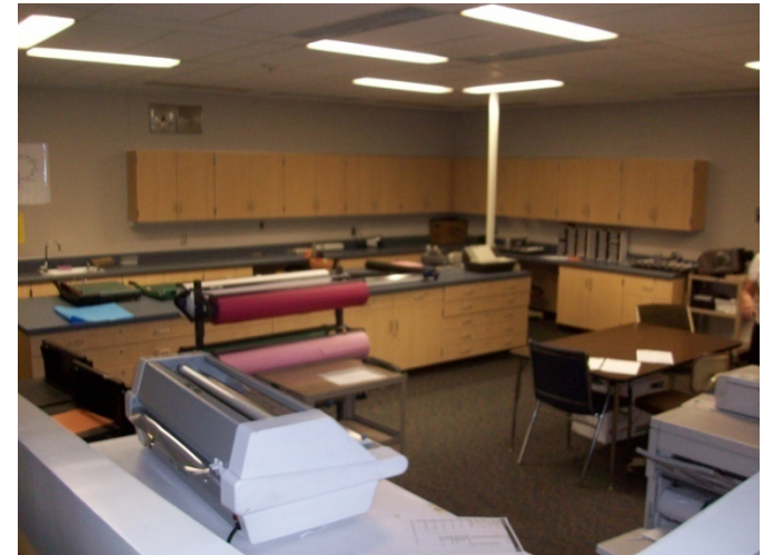
2. Building A- Occupied work room.