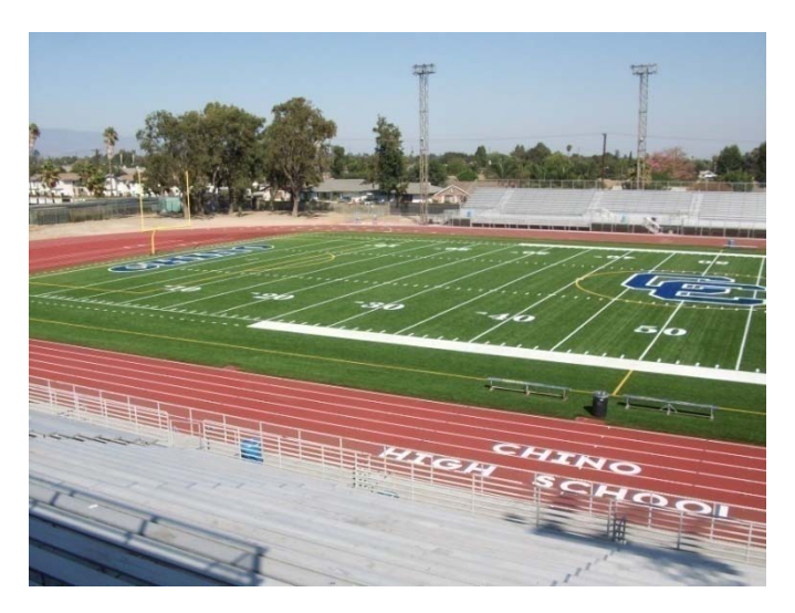
2. Chino HS- New play field and track surfacing complete.