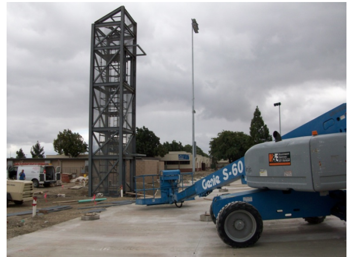
4. Structural Steel for elevator tower.