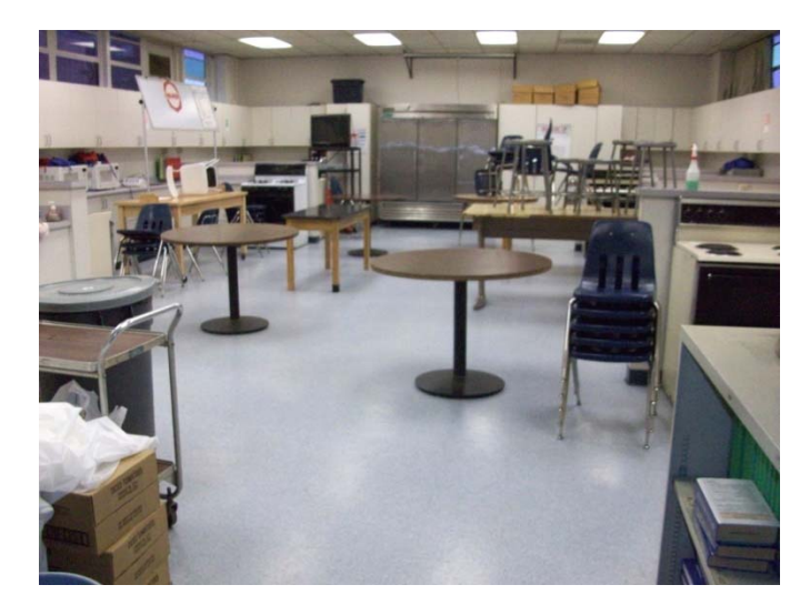
2. Home economic classroom occupied.