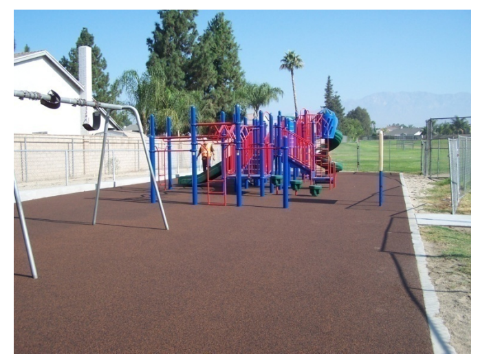
4. New playground equipment installed.