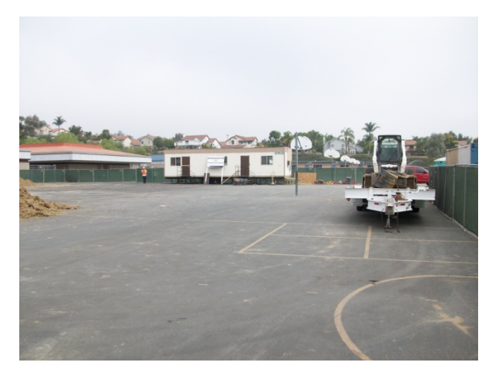
1. Contractor has mobilized on-site.

Status: JRH Construction has begun work on the following activities: Temporary fencing has been installed and mobilization has occurred. Asphalt and concrete demolition is complete. Over-excavation has begun on the south side of the new library expansion.