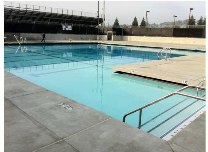
4. The pool is complete.