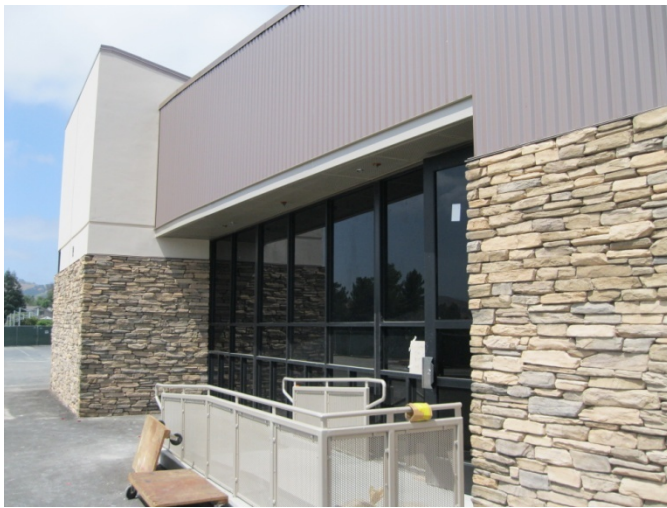
1. Exterior complete.

Status: JRH Construction continues to work on the following activities: The punchlist corrections are nearly complete, with the library now turned over for the school to use. The Project Team walked the punchlist corrections on 10/15. The Master Punchlist will be updated to reflect the corrections completed. Closeout documents have been submitted and are being reviewed.