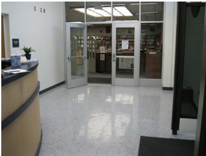
3. New storefront at library.