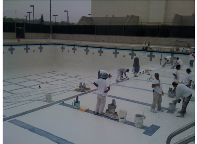
2. Plaster application.