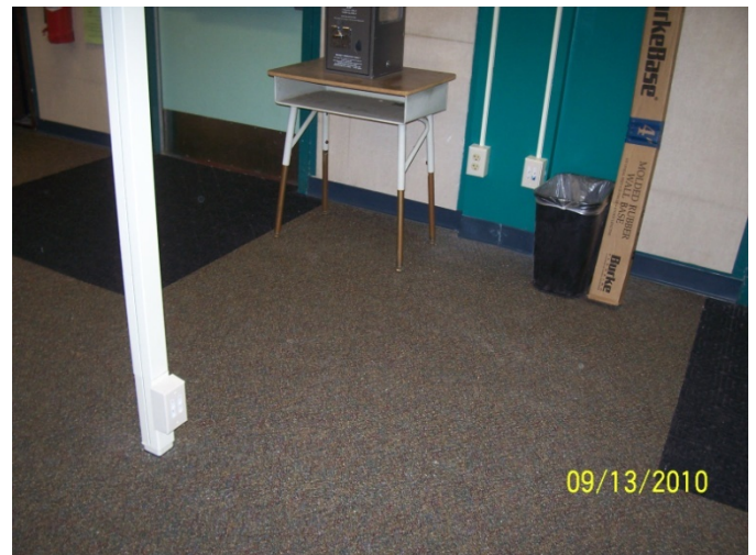
2. Country Springs – Library finishes and data/power work complete.