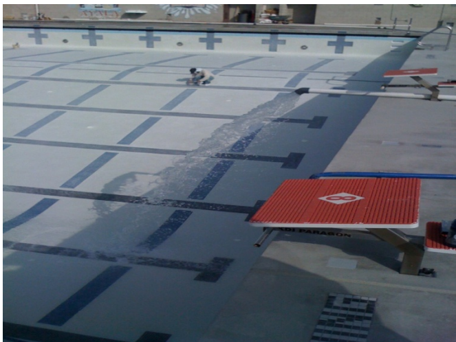
3. Filling pool with water.