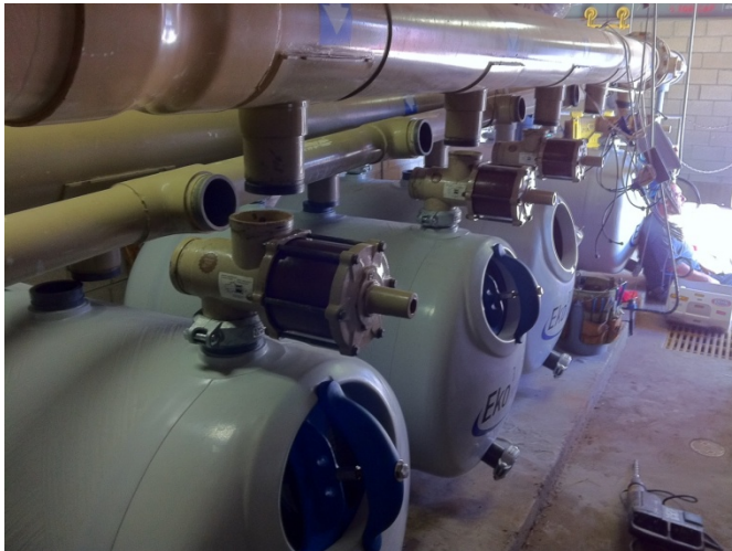
1. New filter tank installations.

Status: The pool was plastered on 10/15/10 and is in the maintenance period. SB County Health final inspection is scheduled for this Friday 10/22/10 along with the punch list walk. The Owner training will take place at the end of next week.