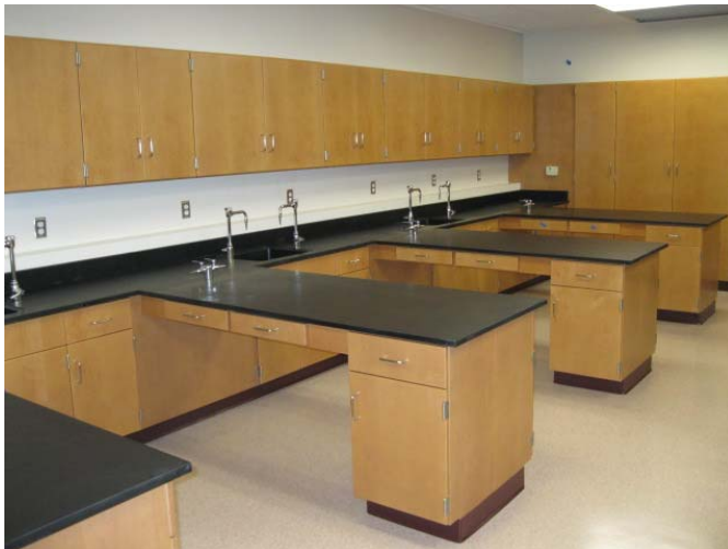
3. Science labs complete.