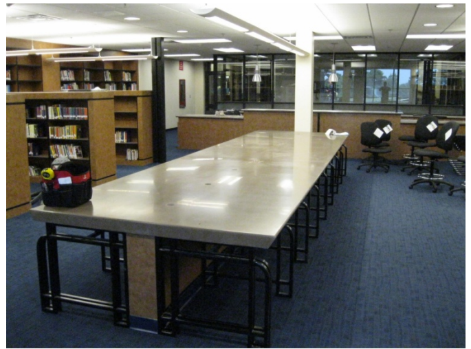
2. Existing area complete.