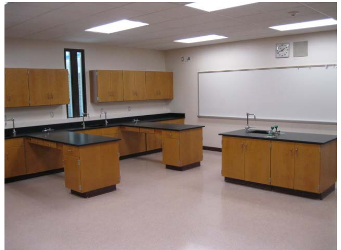
4. Science labs complete.