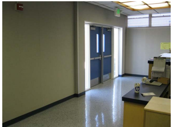
4. Interior modernization complete.