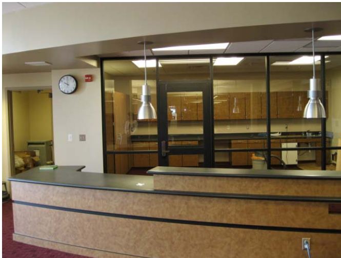
1. Library complete.

Status: JRH Construction continues to work on the following activities: The library and the science labs have been punched. The punchlist corrections are nearly complete, with the science labs and library now turned over for the school to use. The Project Team walked the punchlist corrections on 10/15. The Master Punchlist will be updated to reflect the corrections completed. Closeout documents have been submitted and are being reviewed.