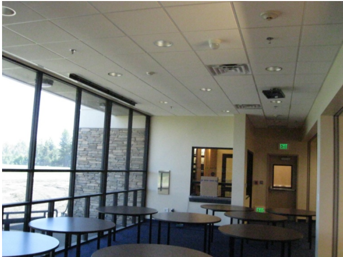
3. Expansion area complete.