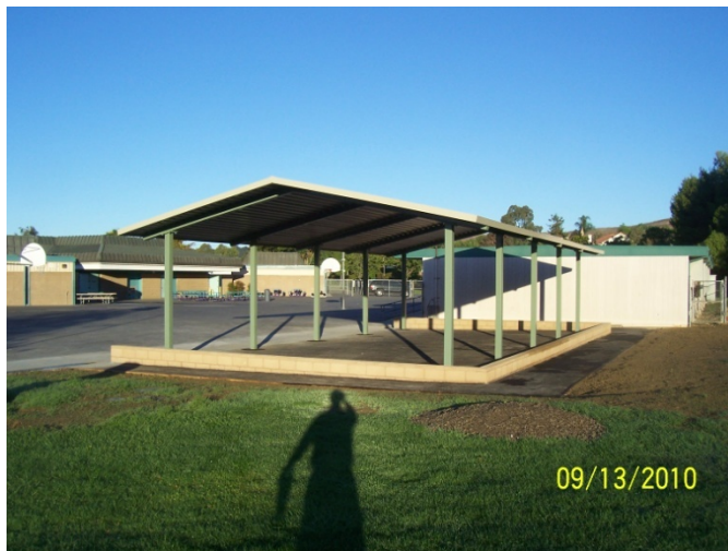
1. Country Springs – Shelter installation complete.

Status: The punch list is complete and ready for formal sign off. The closeout documents are being prepared and will be submitted by early next week.