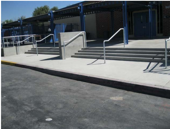
1. Front entrance steps complete.

Status: Dalke and Sons has completed all contractual work, including the punchlist items. All Potential Change Orders have been submitted and the Project Team is working with Dalke to finalize the numbers. The closeout items have been submitted and have been reviewed.