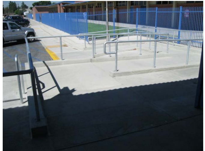
2. Handicap ramp and fencing.