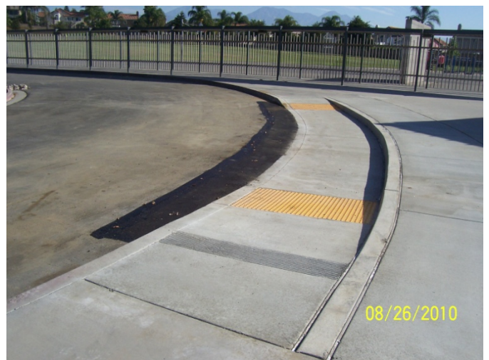
4. Rolling Ridge – Drop-off ramp complete.