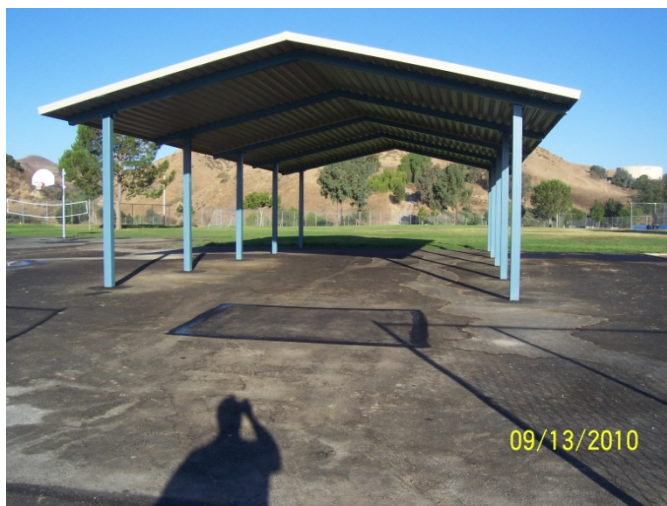
3. Butterfield Ranch – Shelter installation and paving complete.