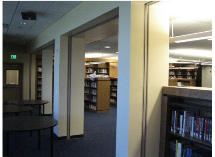
4. Connection from existing to new complete.