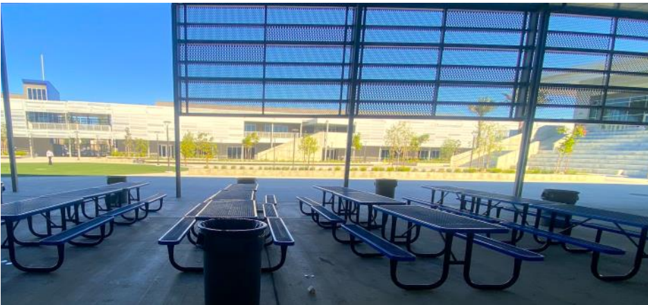
Layout of trashcans surrounding the lunch tables.

"We are aware of the position at hand. We are presently trying to increase the number of times we pull the bags and toss them. This week we are asking during our break on Friday if we can wash out our cans with a pressure washer to push off whatever is attracting them. We are hoping that once we continue to consistently switch and toss out the trash more often, the situation will dim down, and our student's safety will be secured."