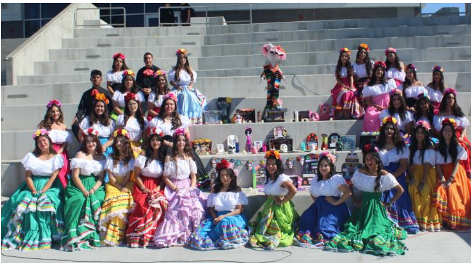
The wonderful Folklorico club by the altar before their performance.

When teachers are asked their opinion, they can agree saying "a four-day school week can help to boost teacher morale."