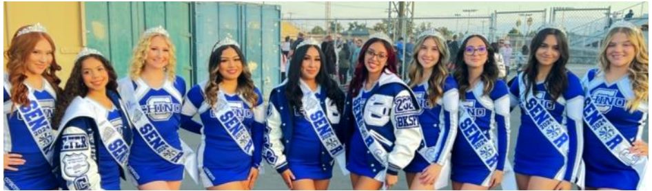
Chino Cheers Class of 2024 Seniors.

Chino football, band, cheer, team managers, and Color Guard celebrated their senior nights at the last Guaranteed home football game in October. Seniors from all five groups got the experience of having loved ones walk them down the red carpet on the football field for what could have been potentially the last time.