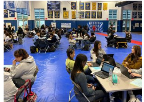
Students in the process of applying at the AVID Application Day.