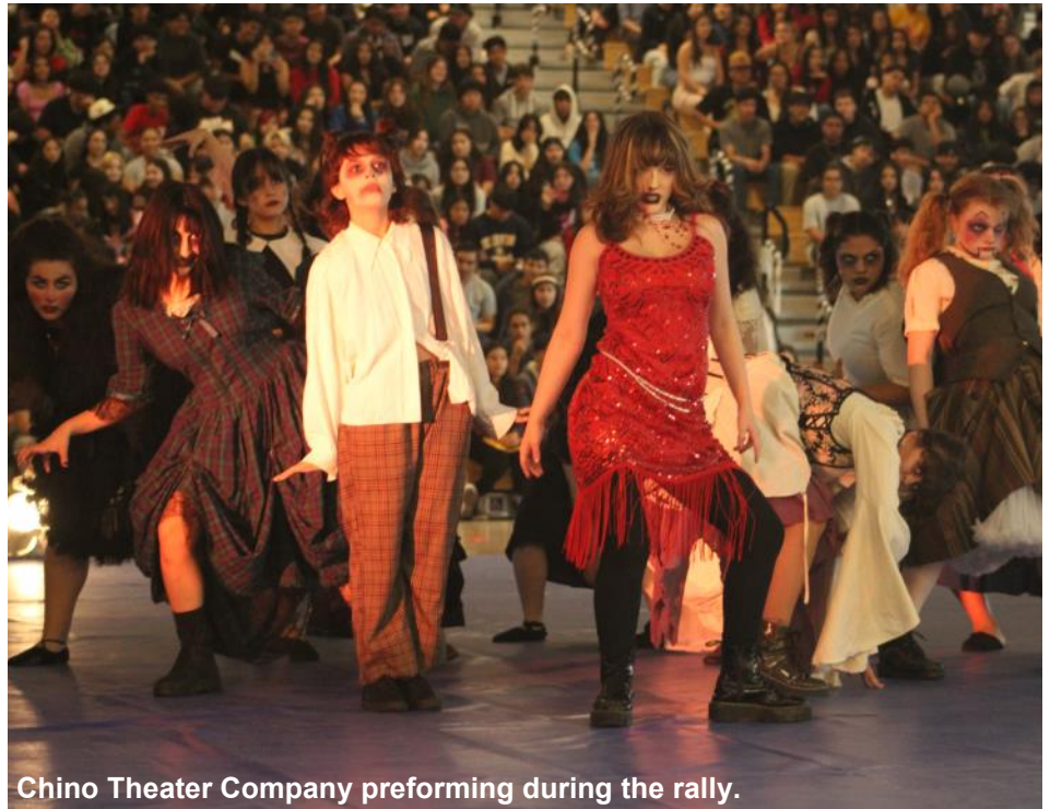
Chino Theater Company performing during the rally.

The next part of the rally was a wonderful performance brought