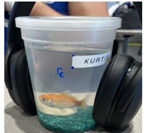
Kurtis The Famous Football Fish Jamming Out to Music.