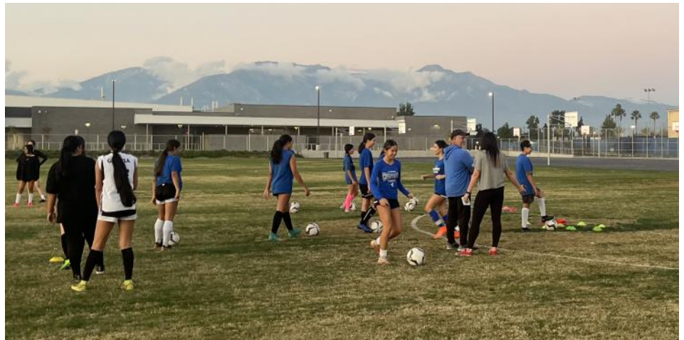
Girls Soccer in the middle of tryouts for the upcoming season.