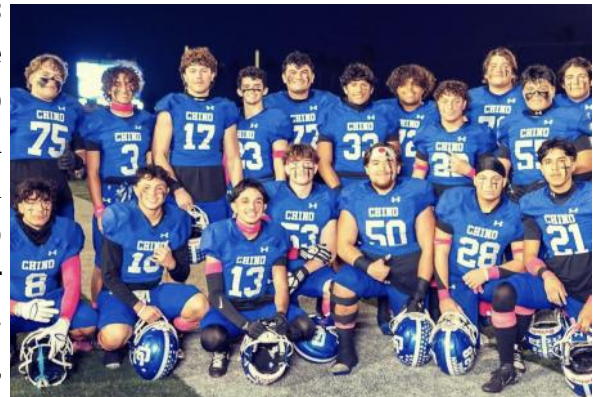
Chino Footballs Class of 2024 Seniors.

The football seniors got to end their night on an amazing moment of going undefeated (10-0) this season. After the game, the team let their friends and families celebrate their incredible achievement.