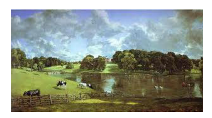
Wivenhoe Park by John Constable

Digital Art Forms (1990s) - Artists used photography, video, and digital media in new ways to capture light. Video has evolved from the analog format to a digital system , which processes words and images directly as numbers or digits. Digital media can be imported to a computer and shared with others.