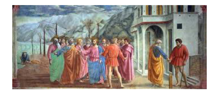
Tribute Money by Masaccio

Italian Renaissance (1400-1520) - The fifteenth century was a time of growth and discovery; Inspired by classical works and by nature, artists tried to make their artworks look more realistic.