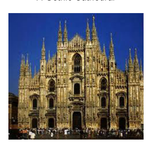
A Gothic Cathedral

Gothic Art (1150-1500) - The art style of this period replaced classical Greek and Roman forms; French architects used pointed arches, piers, and flying buttresses to erect slender, soaring cathedrals, and since walls could be made much thinner, these were filled with colorful stained-glass windows depicting Christian themes.