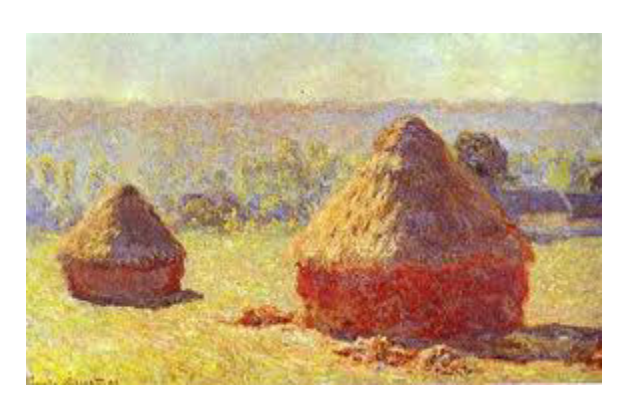
The Haystack, End of the Summer by Claude Monet

Post-Impressionism (1880s) - Artists in the 1880s and 1890s looked for ways to represent a more personal, expressive view of life. While they continued to consider the effect of light on color, they used more intense hues and returned to stronger contours and more solid forms