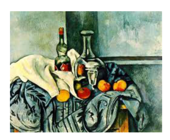
Still Life with Peppermint Bottle by Paul Cezanne

Post-Impressionism (1880s) - Artists in the 1880s and 1890s looked for ways to represent a more personal, expressive view of life. While they continued to consider the effect of light on color, they used more intense hues and returned to stronger contours and more solid forms