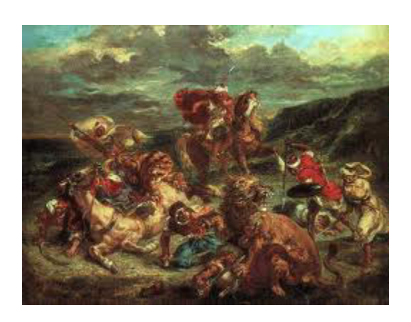
The Lion Hunt by Eugene Delacroix

Romanticism (1790-1850) - Portrayed dramatic and exotic subjects perceived with strong feelings