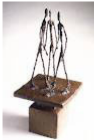
Three Men Walking